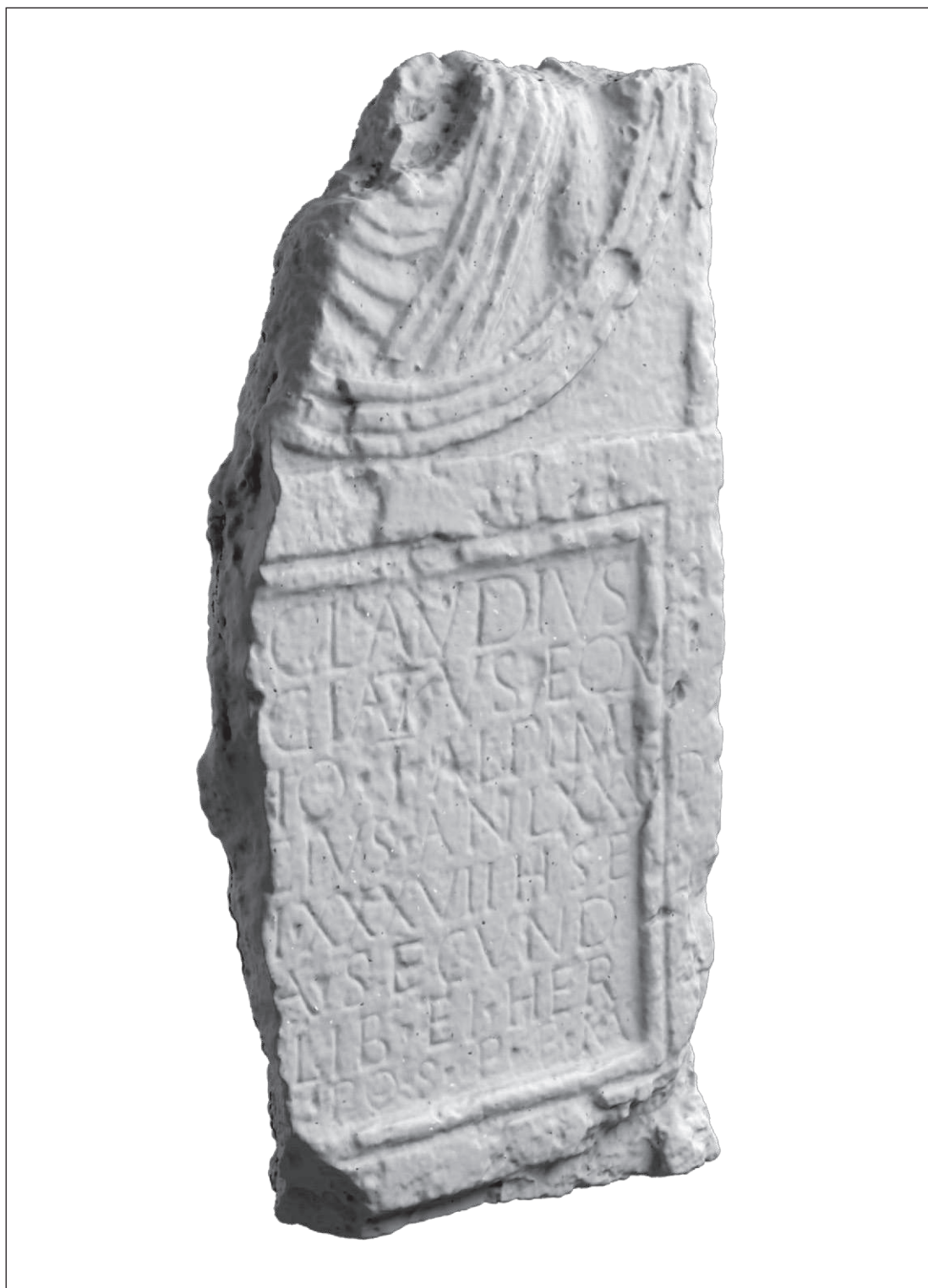
Pl. II. Roman tombstone from Dunaszekcső, detailed view.