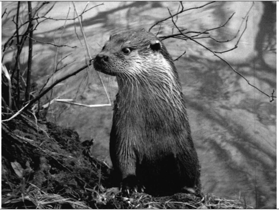
Fig. 3 Otter from Anieș Vallez (Rodna Mountains National Park), Photo: Claudiu Iușan