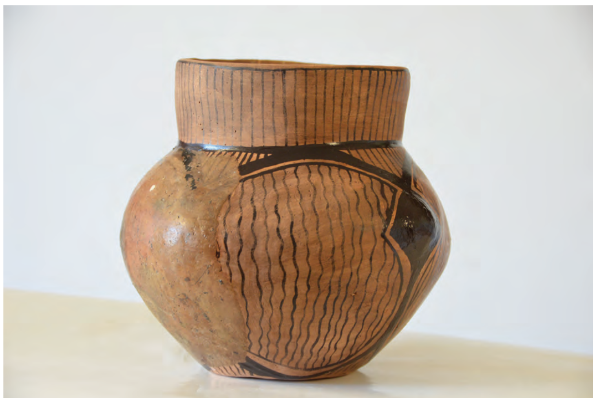
Picture 6. Neolithic pot decorated with a mixture of birch bark tar with natural bitumen (after restoration).