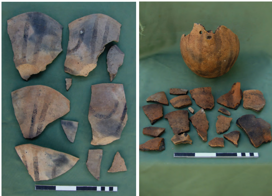
Picture 2 – 3. Porringer fragments (left) and amphora fragments (right) decorated with a mixture of birch bark tar with natural bitumen (during restoration).

According to the thickness of the pictorial layer and the type of decoration, there were cases in which the pictorial layer was spread on extended, dense surfaces, but also situations in which only the trace (imprint) of the decorations was preserved (Picture 2).