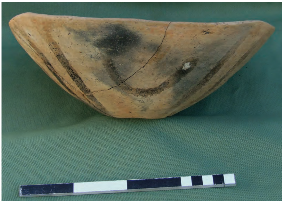
Picture 5a. Neolithic porringer decorated with a mixture of birch bark tar with natural bitumen (after restoration).