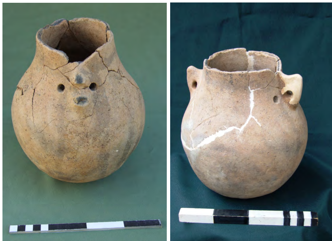
Picture 4. Neolithic amphora decorated with a mixture of birch bark tar with natural bitumen (after restoration).