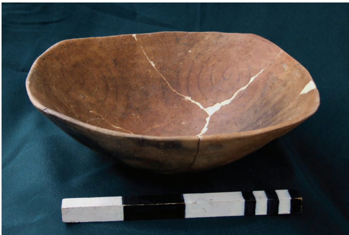
Picture 5. Neolithic porringer decorated with a mixture of birch bark tar with natural bitumen (after restoration).