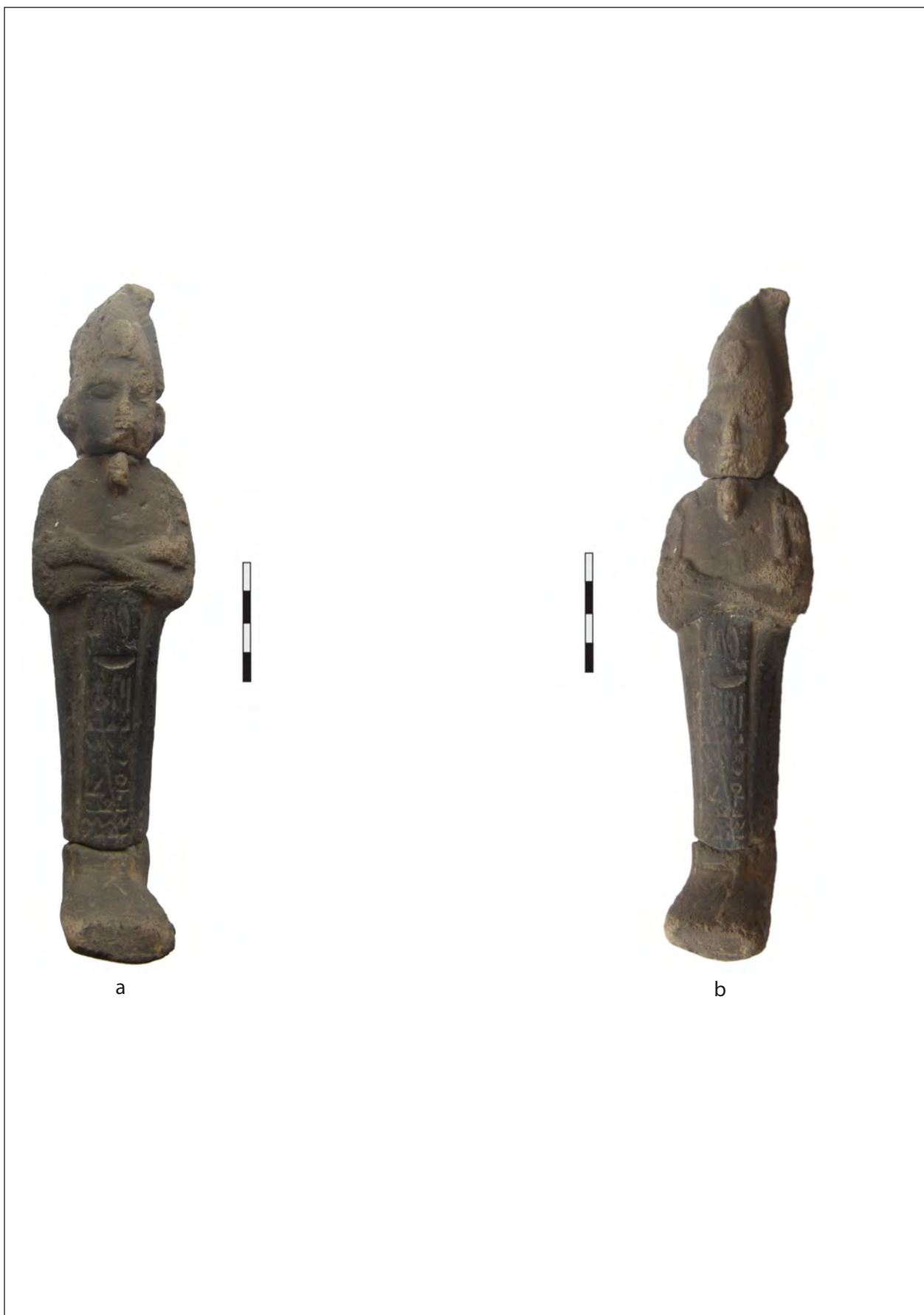
Fig. 1. a–b. Osiris shape pseudo-shabti frontal view.