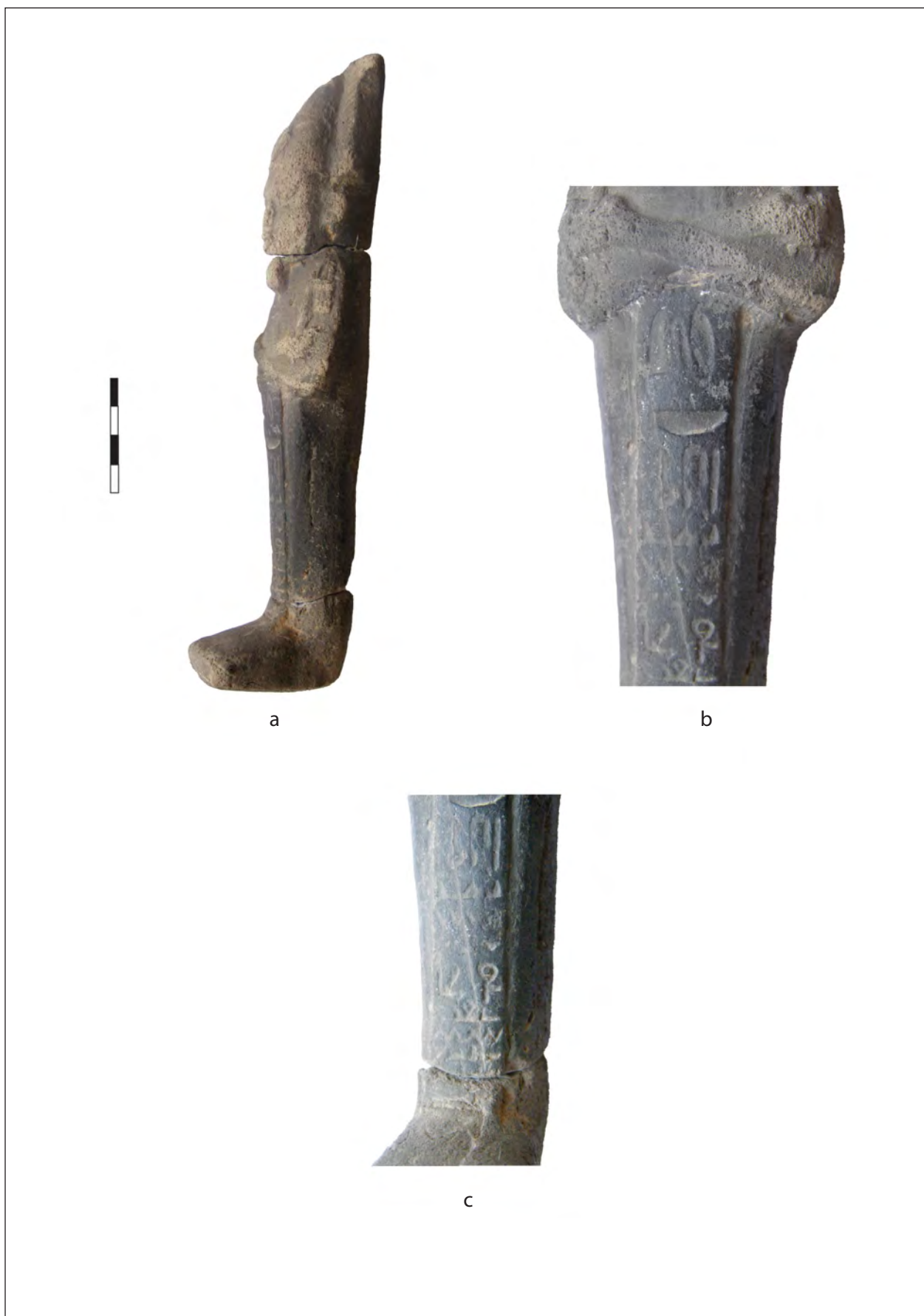
Fig. 2. a. Osiris shape pseudo-shabti side view; b. Detail of the upper part of the inscribed strip with hieroglyphic imitations; c. Detail of the lower part of the inscribed strip with hieroglyphic imitations (photo courtesy of the Caransebeș Ethnography and Border Regiments County Museum).