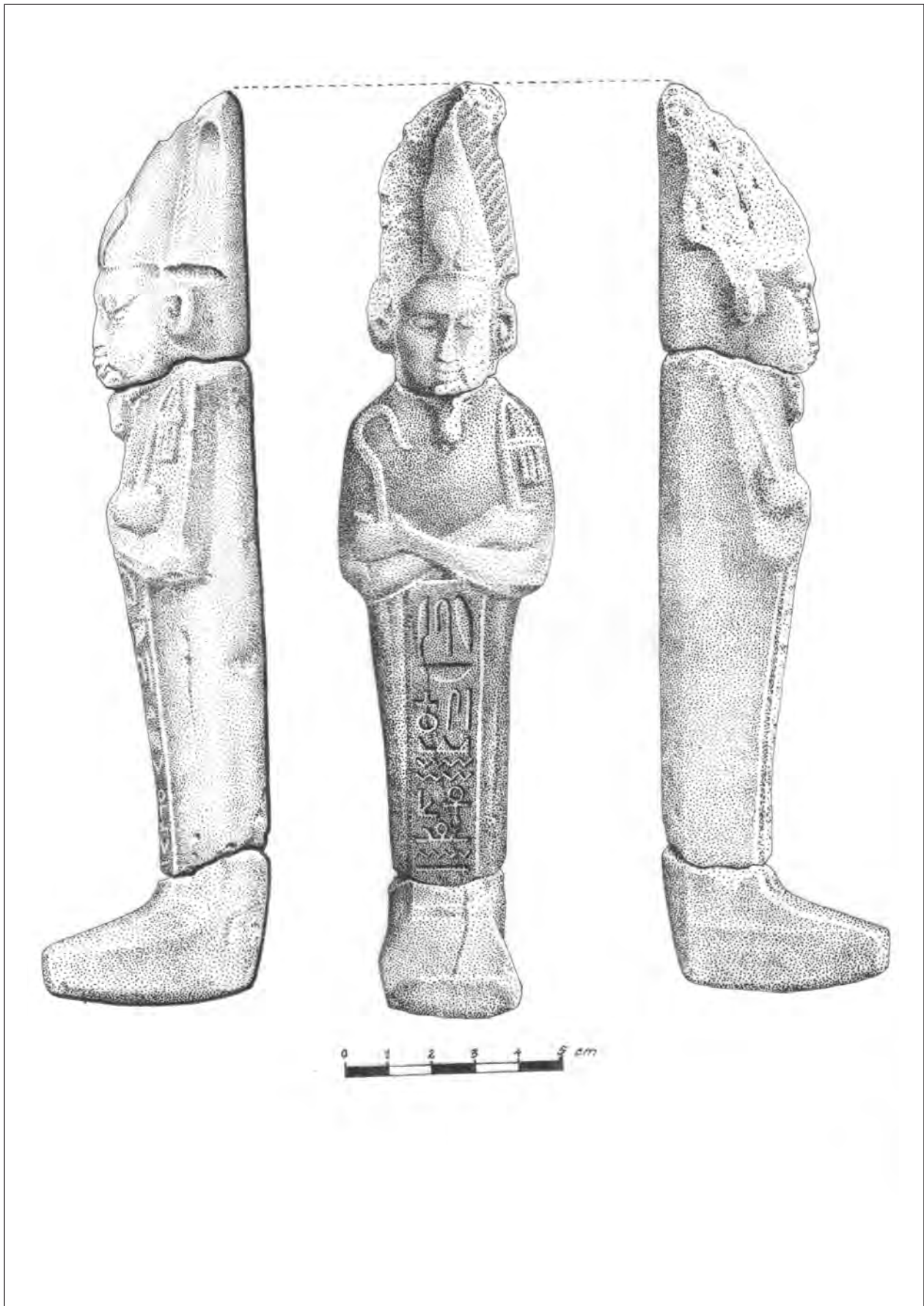
Fig. 3. The Shabti statuette (drawing S. Petrescu).