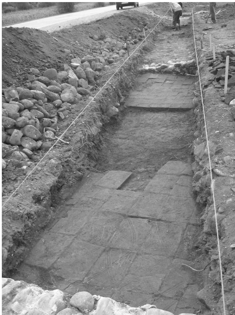
Fig. 1. Buceșnița “La Numere”. Archeological researches 2006.