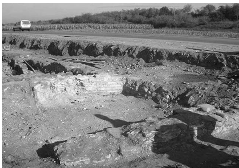
Fig. 2. Bucoșnița "La Numere". The Bath