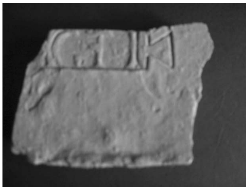
Fig. 4. Buceșnița “La Numere”. The Stamp GTI