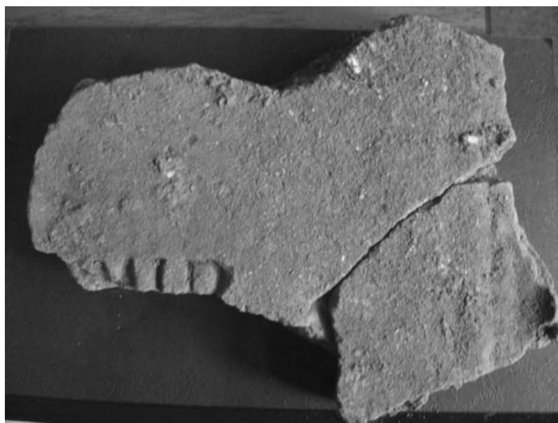
Fig. 3. Buceșnița “La Numere”. The Stamp MID