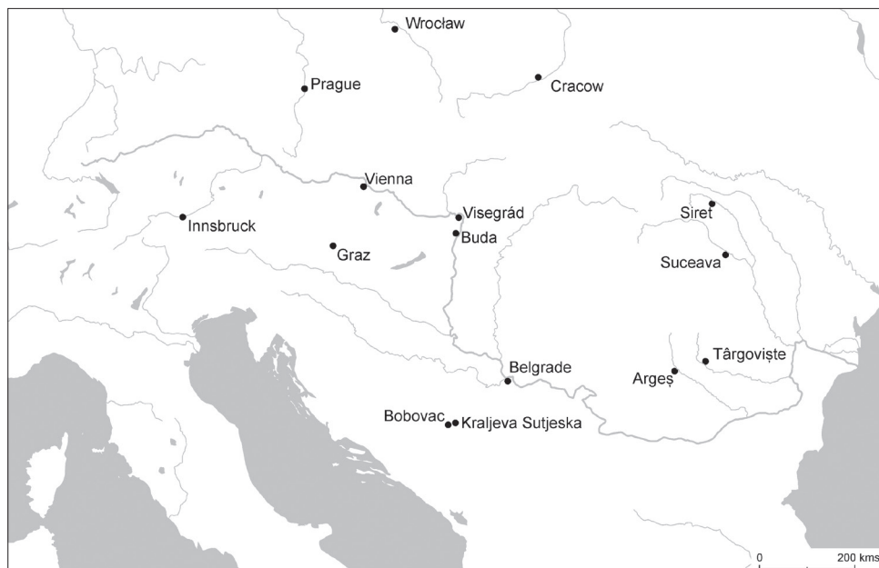
1. Rulers' seats and residences in East Central Europe in the fourteenth century (map prepared by András Vadas)

the choice fell on Timișoara because its surroundings were the only substantial area in the county that was not controlled by any of the oligarchs – big enough for the mustering of armed forces and rich enough to make it possible to finance their upkeep. From here he could easily reach both Transylvania and the Transdanubian estates of the Kőszegi family, one of his chief opponents at that time. 14 Six years later his choice fell on Visegrád by the Danube, where besides (or rather above) the urban palace the strong walls of the Upper Castle and the Lower Castle offered protection in times of danger. Nevertheless, this pattern of translocation was not unique to Charles, since even in the fourteenth and fifteenth centuries signs of fixed residence are still more or less sporadic in many parts of Europe. Settling on a definite location for a “capital city” is not a practice seen until the late Middle Ages or even beyond. In this respect Hungary shares similarities with the polities east and south of it. The example of Visegrád, where the private residences of the main judges and other dignitaries of the realm also served as agencies of state administration, still displays the archaic pattern of personal bonds between the ruler and his confidants. 15