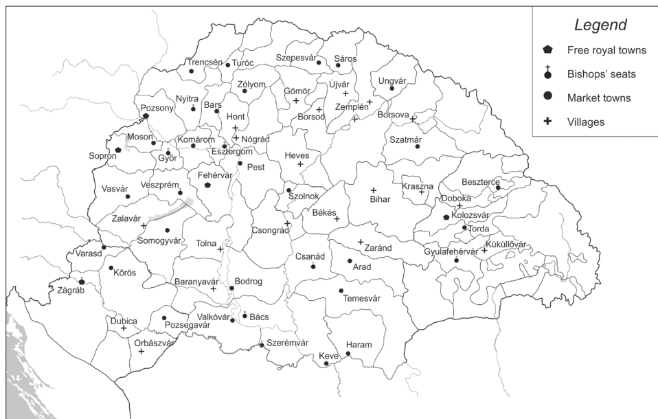
3. The legal standing of the former centres of royal counties in the Angevin period (note: this map shows the medieval Hungarian names of the county seats, because they are usually identical with the names of the historical counties) (map prepared by András Vadas)

the development of individual towns as well as the urban network, and these changes were strongly bound up with the intensification of long-distance trade after the first decades of the fourteenth century. Towns that had been primarily preoccupied with expanding their boundaries and amassing landed properties: arable lands, woodlands and vineyards, now became merchant towns in the strict sense of the word. They were usually close to the borders of the kingdom, for instance Sibiu (Szeben, Hermannstadt), Sighișoara (Segesvár, Schässburg) and, further to the south-east, Brașov (Brassó, Kronstadt) in Transylvania – places where local conditions and the demands of long-distance trade favoured the emergence of new centres. Further examples are the towns of Košice, Bardejov, Prešov (Eperjes), Levoča and Sabinov (Kisszeben) in the north-east of the country. 47