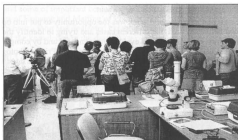
Fig. 2. Practice in analyzing the photographs.

So, the first week was dedicated to the Chemistry and the Methods availables for Identification of the Old Photographic Processes. The presented lectures become the theoretical background for the next step: the series of tests and analyses intended to set up the individual experience in approaching the issues.