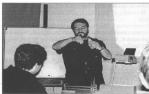
Fig. 3. Prof. Dusan Stulik explaining the Silver Chemistry details.

The strange chemistry of Silver and its light-sensitivity, the importance of halides and binding media, the alternatives in image construction (the Non-Silver processes), were important topics, also because of some laboratory demonstrations.