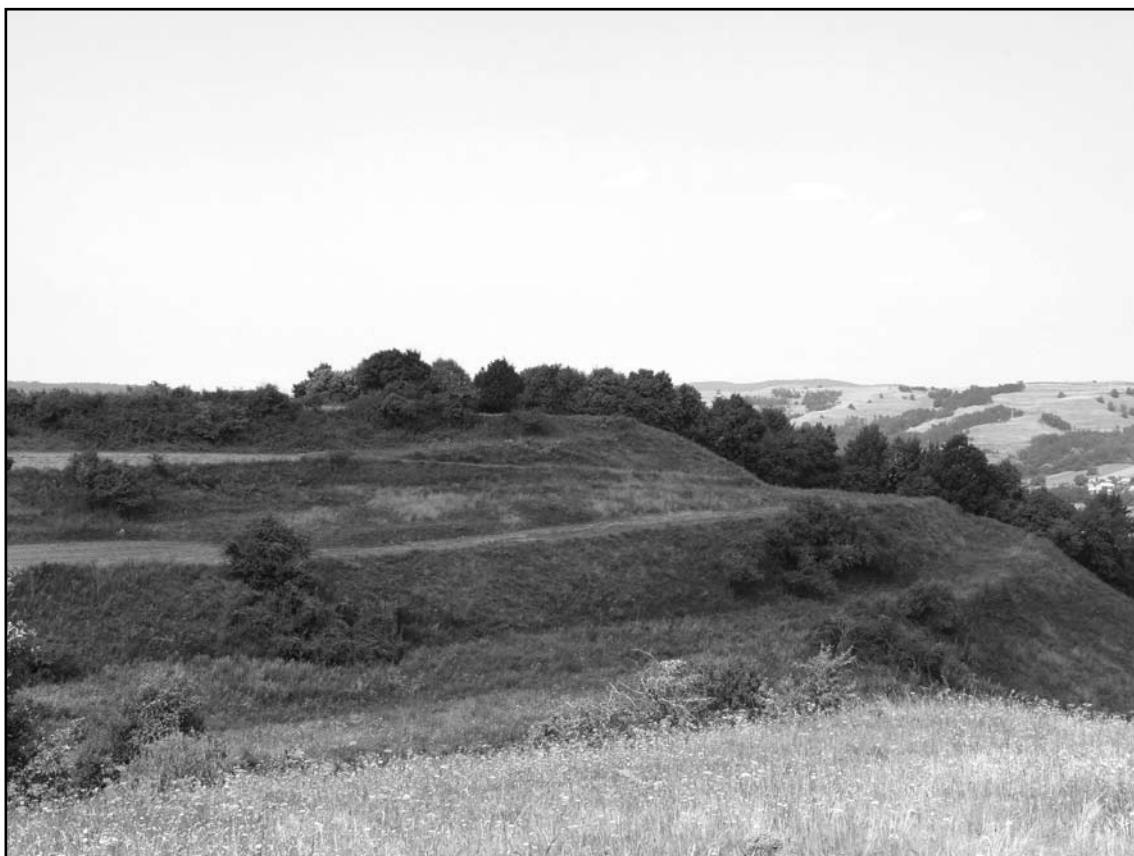
Pl. 1 The Coțofeni settlement from Boarta-Cetățuie