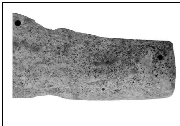
Pl. 2 The antler sceptre from Boarta-Cetățuie (1); decoration details (2-3)