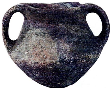
Fig. 5. Beaker from Ostra (according to Dmitrović 2016).