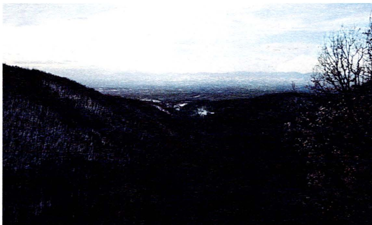
Fig. 7. The view from Sokolica in Ostra hillfort toward the West Morava valley and the Jelica mountain range.