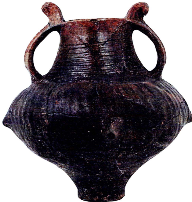
Fig. 3. Beaker from Jančiči (according Dmitrović 2016).