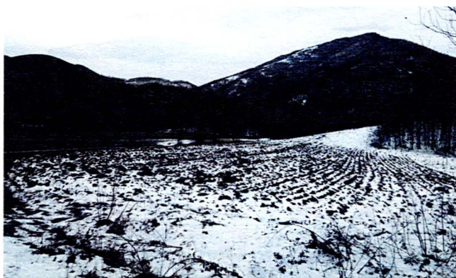
Fig. 6. The site of Sokolica in Ostra.