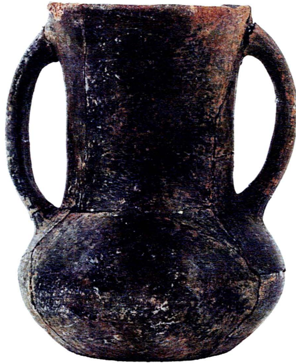
Fig. 2. Beaker from Dučalovići (according Dmitrović 2016).