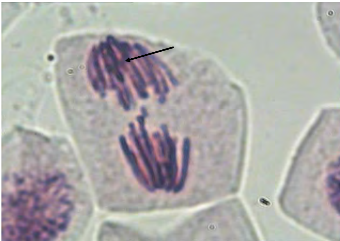
Figure 1. Acentric fragments and arch (arrow) in anaphase ( Nigella damascena L.).

Figura. 1. Fragmente acentrice și arch (sageata) în anafază ( Nigella damascena L.).