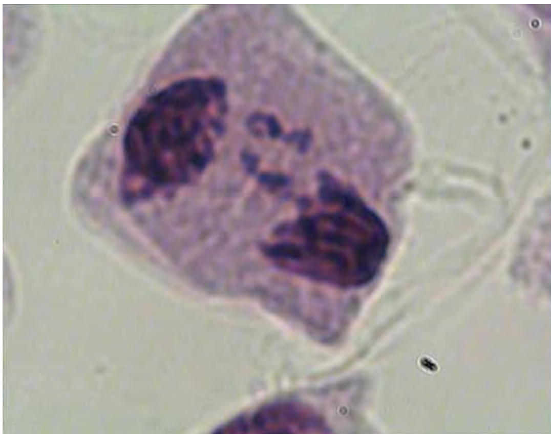
Figure 3. Broken bridge and acentric fragments in telophase ( Nigella damascena L.).

Figura 3. Punte ruptă și fragmente acentrice în telofază ( Nigella damascena L.).