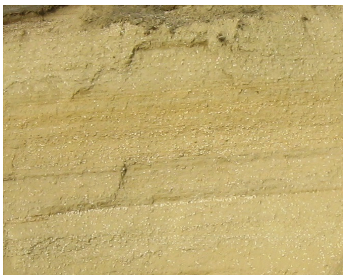
Figure 2. Bălta outcrop with lamellibranchiate chaotically spread in horizontal sand deposits (photo C. Enache).

Moreover, there are places where the shells are chaotically spread, in a stack of sandy deposits more than 20 m thick, as it is the case at Bălta (Fig. 2) and Smadovița in Oltenia, with quasi horizontal deposits specific to lakes and not to fluvial bars in which the deposits are oblique. The predominance of a certain species, the chaotically spreading and the predominant vertical position of the shells in thick stack of sand arranged in horizontal layers cannot be assigned to a fluvial deposition, but to a quiet deposition on the bottom of the lake.