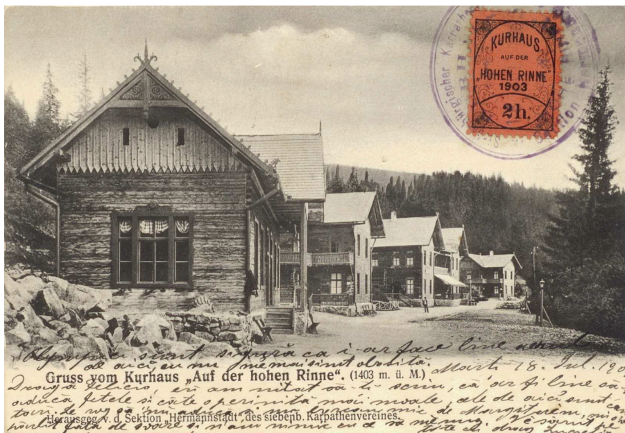
Figure 1. Old postal card representing Păltiniș Resort.

The Climate Resort Păltiniș was founded in 1894 by SKV (Transylvanian Carpathian Society - Siebenbürgischer Karpathen-Verein) and it is the oldest resort in the country, located at the highest altitude of 1442 m. Păltiniș resort is among the oldest and most representative tourist regions of Romania (Fig. 1).