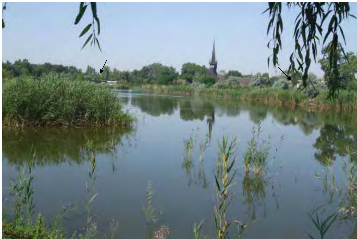
Photo 1. Observation points (1 and 2) - "Microdelta". Foto 1. Punctele de observare (1 și 2) - "Microdelta".

The present paper aims at rendering the wild birds' species which were observed in Microdelta for twelve months (January 2008, January 2009); the observations were concluded with data collections. Observations were made twice a day, between January and May, between October and September and four times a day between June and September from the water level and from 3 meters height above the water surface, in two observation points specially built in this aim on the adjacent area to aquatorium (Photo 1).