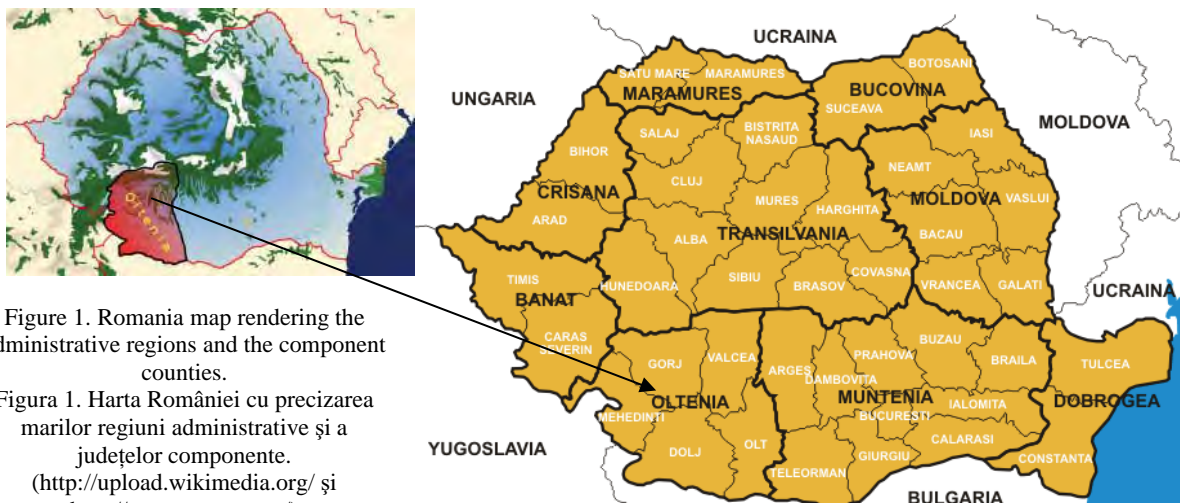
Figure 1. Romania map rendering the administrative regions and the component counties.

Oltenia entirely includes the counties: Gorj, Dolj and parts of the counties: Mehedinți (mainly in Oltenia, but the western part belongs to Banat), Vâlcea (mainly in Oltenia, but the eastern part belongs to Muntenia), Olt (the western half, the former Romanați County), Teleorman (only the village Islaz) (Fig. 1).