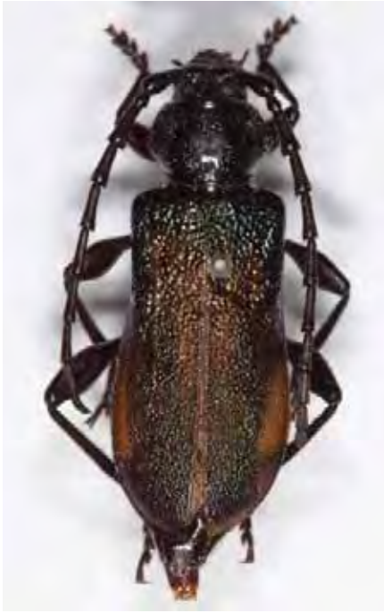
Figure 2. Ropalopus insubricus .