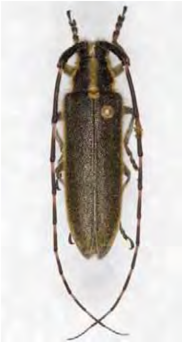
Figure 1. Agapanthia cynarae .