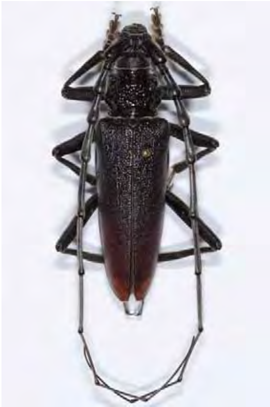
Figure 1. Cerambyx cerdo .