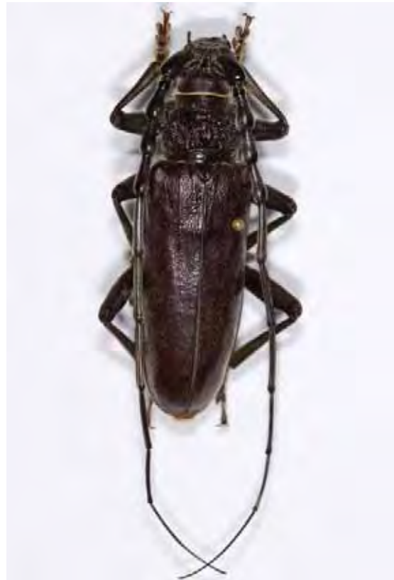
Figure 4. Cerambyx welensii .