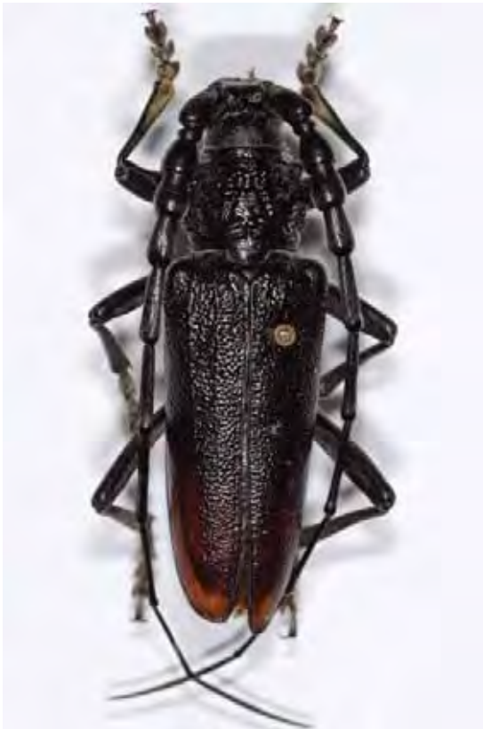
Figure 3. Cerambyx nodulosus .