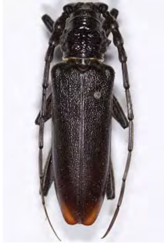
Figure 2. Cerambyx miles .