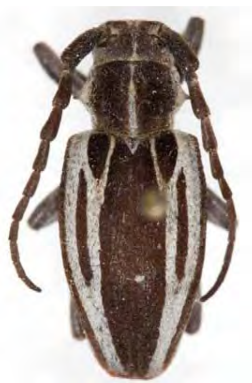
Figure 5. Neodorcadion exornatum .