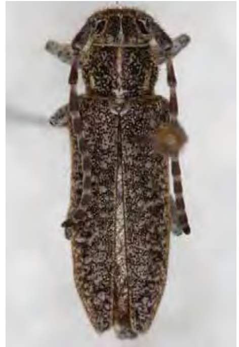
Figure 3. Pilemia tigrina .