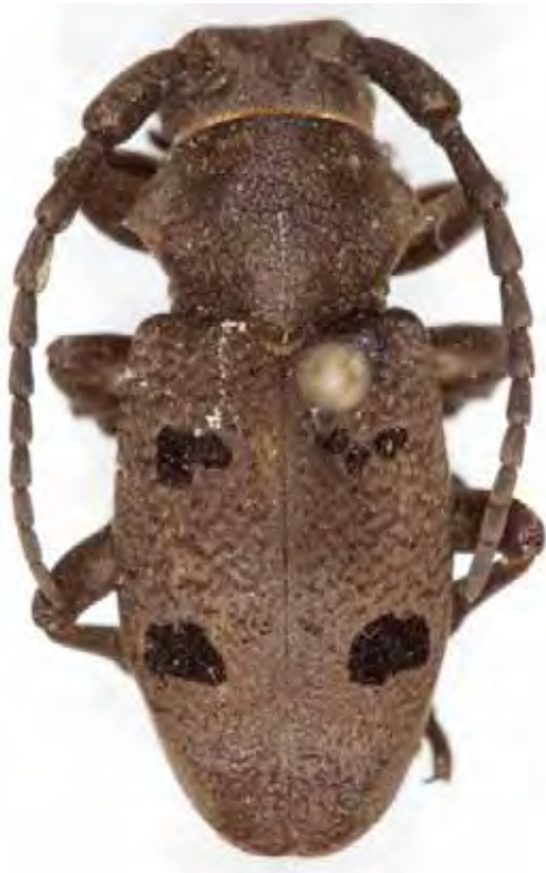
Figure 4. Herophila tristis .