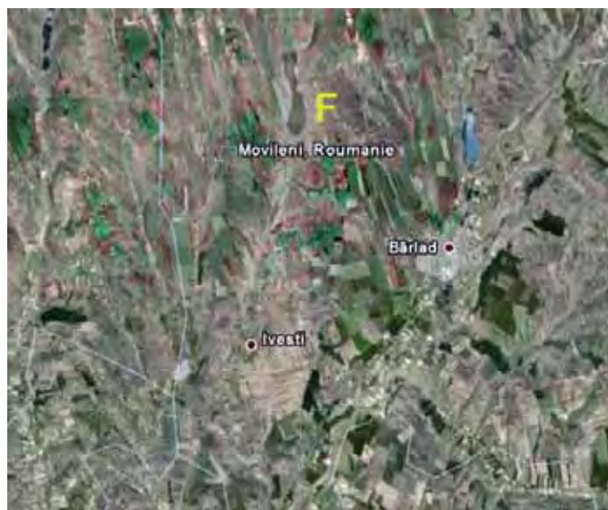
Figure 1. Location of Movileni on the map (Google Earth 2010 satellite imagery); the fossil-bearing site is marked F. Figura 1. Localizarea satului Movileni (Google Earth 2010 imagine satelitară); punctul fosilifer, marcat cu litera F.

The Scythian Platform (East Romania; SÂNDULESCU, 1984; SÂNDULESCU & DIMITRESCU, 2004) presents, on large areas, Pleistocene deposits that cover older formations (IONESI, 1994). As it turned on, the Pleistocene formations yielded several times vertebrate remains, mainly of large mammals. The majority of these fossils belongs to large herbivores, mainly to mammoth (APOSTOL, 1968; URSACHI & CODREA, 2008). Southwards, in Tecuci, bovids had been reported too, in assemblages including mammoth, wooly rhinoceros, horses (APOSTOL, 1967; APOSTOL & VICOVEANU, 1970; SIMIONESCU, 1990). We report now the presence of the steppe bison at Movileni (commune Coroiești), northwest of Bârlad town (Vaslui District), on Tutovei Hills (Fig. 1).