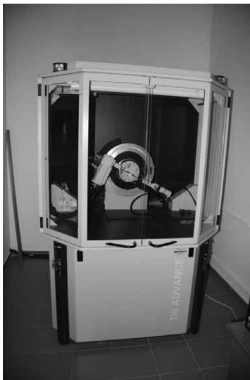
Figure 1. X – ray diffractometer Bruker D8 ADVANCE. Figura 1. Difractometru cu raze X Bruker D8 ADVANCE.

The X-ray tube, which has a copper anode, releases radiation. Minerals, which in size are up to 0.1 mm, are carefully chosen using binocular magnifying glasses and washed with acetone in order to freeze the organic substance and the sesquioxides amorphous iron. The powder thus obtained is fixed by pressing on the sample and introduced in the device. The laboratory conditions include an electric current with an intensity of 40 mA and a voltage of 40 kV, a kind of standard input, scanning speed of 0.01 degrees per second theta between 4 and 90 degrees. As internal standards, there is also used synthetic corundum, achieving an accuracy of 0.01 degrees 2 theta for the measured interval. In addition, the X-ray results (Fig. 2) can be interpreted with the Diffrac Eva 13, for determining the quality of the crystalline phases, and the Topas program, for quantitative determination, including the amorphous phase.