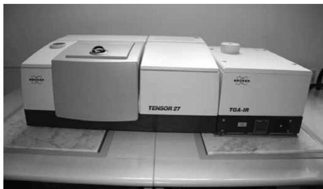
Figure 3. Absorption spectrometer with infrared Fourier, Bruker Tensor 27 type.

High quality of spectra minerals obtained in infrared depends on the preparation of evidence. The physical factor is the most important for obtaining spectra of very good quality in particle size. Theoretically, particle size must be smaller than the wavelength of incident radiation. This will reduce the spreading of radiation and provides increase of the transmitted energy. For the samples examined in the infrared medium region (4,000 - 200 \text{cm}^{-1} ), the particle size should not exceed 2 \mu\text{m} . The break usually runs in the mortar agate in the presence of liquids (alcohol, acetone) to prevent the spreading of the sample.