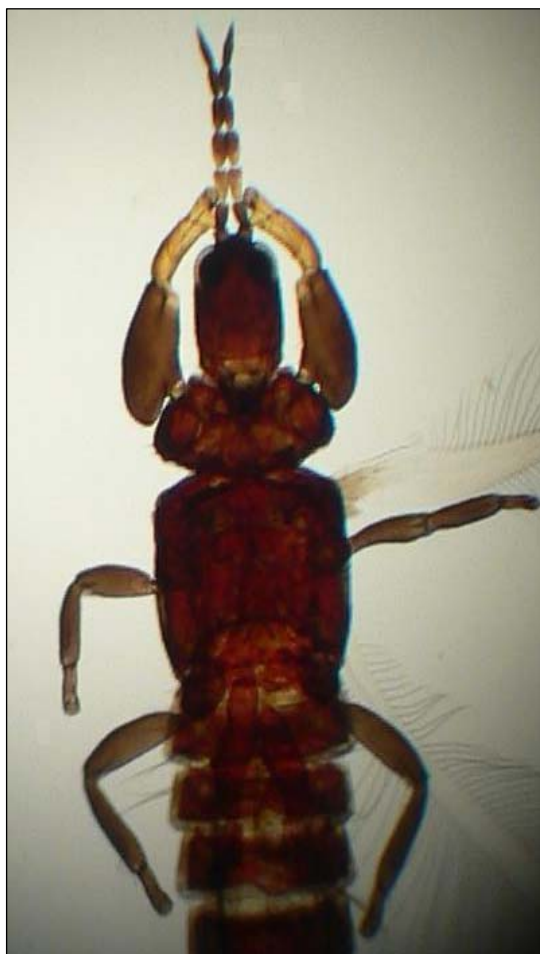
Photo 1. Haplothrips leucanthemi , male. Foto 1. Haplothrips leucanthemi , mascul (original).