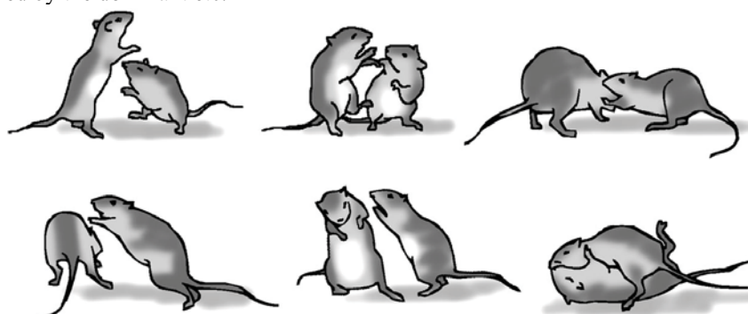
Figure 2. Various types of aggressive contacts. / Figura 2. Diverse tipuri de contacte agresive.

Most varied were the elements connected with agonistic interactions, among which there can be mentioned attacks, fight, chase, escape without an attack and after it, winning the battles, pushing and boxing, aggressive stands (Fig. 2), squeaks, and sometimes it was registered active seizure of foreign territory (occupation). To this group interactions there can be also attributed avoiding contact with the partner, intense surveillance from the corner over the actions of the partner, as well as relations of domination-subordination, in which the subordinate animal lay on his back to avoid aggressive contact with the dominant, bowed his head in front of him, allow to climb on itself, to sit on top of itself or to be trampled by the dominant etc.