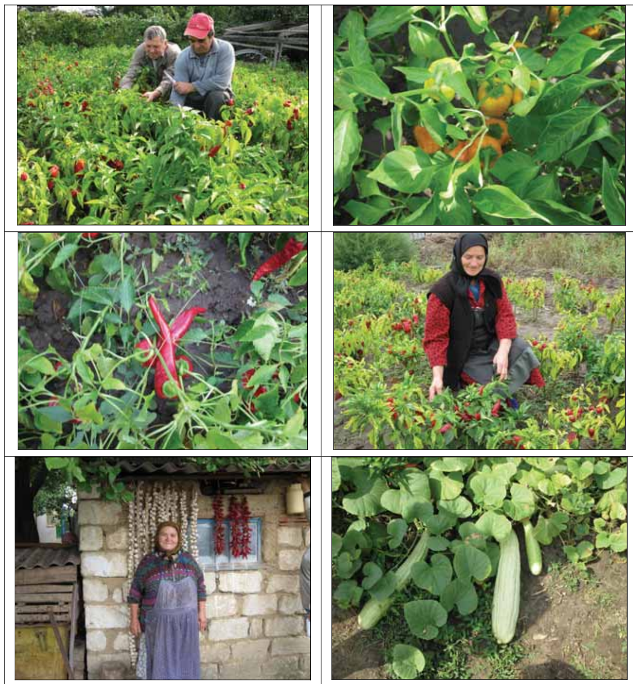
Figure 3. Local forms collected in Taraclia district. / Figura 3. Forme locale colectate în raionul Taraclia (original).