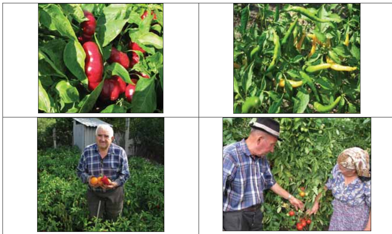
Figure 1. Local forms collected in Criuleni district. / Figura 1. Forme locale colectate în raionul Criuleni (original).