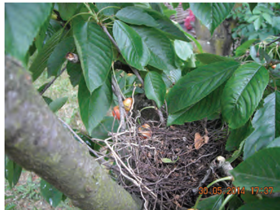
Figure 2. Nest of Collared Dove (original).

The diameters of the nests are variable, from 10 to 15 cm. A complete clutch generally contains two eggs. The young pairs can have a clutch with one egg. This rule is not always valid. Thus, in a nest installed on a concrete pillar and observed during the year 2014, the first clutch contained one egg, the second, the third and the fourth contained 2 eggs and the fifth contained only one egg, although the pair was not young. Another reason that could limit the number of eggs is probably the tight space where the nest is installed. Thus, at the nest observed in 2012, situated under eaves, between a drain pipe and a wall of A.L Ilie's house, all the clutches had only one egg, despite the pair was not young. An exceptional case, probably unmentioned until now in the scientific literature, indicates one clutch with three eggs. The nest was observed on my vine arbour, on June 1, 2013.