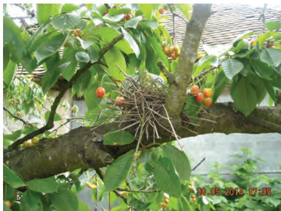
Figure 1. Nest of Collared Dove (original).

The material of construction was extremely different: branches, wires or stems of some gramineae. The nest is a simple platform, without lining and can be used by the same pair for several years (generally to 4 years) – Figs. 2, 5.