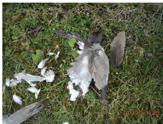
Figure 6. A Collared Dove killed by goshawk (original).

In the analysed period we identified the harmful species which had access at the nests situated on trees or on vines: the man and the cat. Other species hunt the adult birds: goshawk ( Accipiter gentilis Linnaeus, 1758) - Fig. 6.