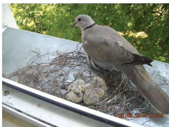
Figure 5. Nestlings of the Collared Dove (original).

Under favourable conditions, the period of time between two reproductive cycles is very short (3 – 4 days). The nestlings have a grey-yellow colour or even white – yellowish (Fig. 5).