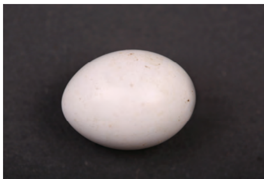
Figure 3. Egg of Collared Dove (original).

The eggs are oval, smooth, with feeble lustre. The colour of the eggs is white (Fig. 3).