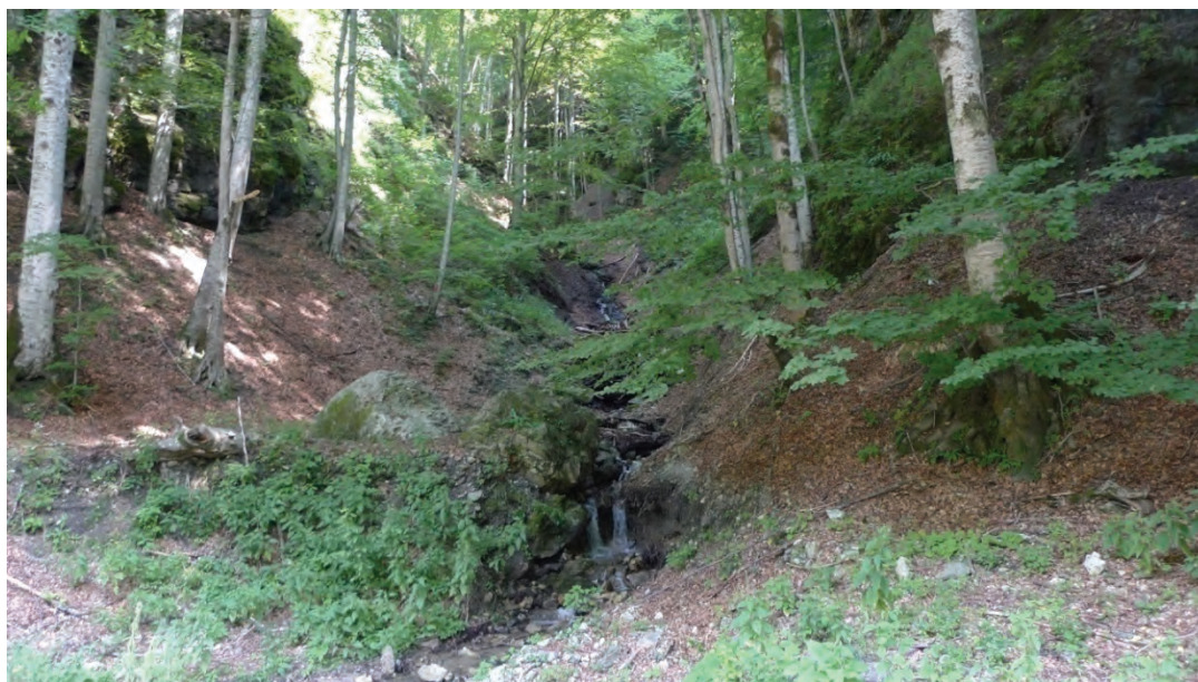
Figure 2. Beech forest in Valea Vâlsanului Reserve (original).

Potential threats are related to property regime, the lack of understanding of the legislation of nature protection, misapplication by the state of the compensation for the limitation or suppression of protective measures in the protected areas. Cutting, extraction of alive or dead wood from private forest is a dangerous issue for the present and also for the future. Arboretum composition from the high altitudes will change, even if exploitation will be made according to ecological shares. It will be necessary to introduce softwood seedlings.