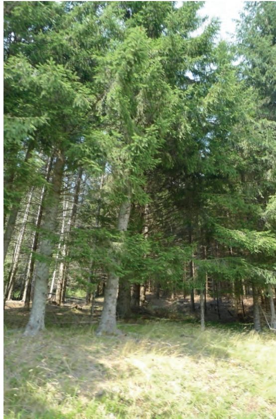
Figure 3. Spruce forest in Valea Vâlsanului reserve (original).

Floristic composition: edifying species: Picea abies și Abies alba . Characteristic species: Hieracium rotundatum . Other important species: Senecio nemorensis , Campanula abietina , Calamagrostis villosa , Luzula luzuloides , Luzula sylvatica , Oxalis acetosella , Stellaria nemorum , Lycopodium annotinum , Gentiana asclepiadea , Huperzia sellago , Dryopteris filix-mas , Fragaria vesca , Polygonatum verticillatum .