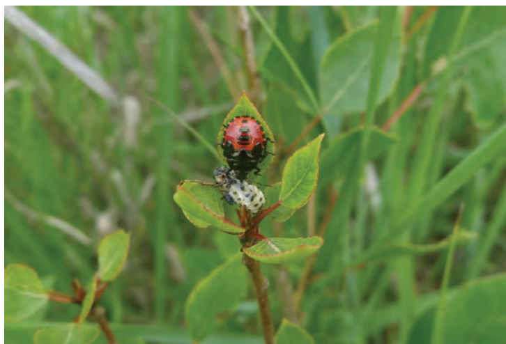
Figure 4b. Early instar nymph (the 4 th stage of development) of Zicrona caerulea preying a larva of M. populi (original).