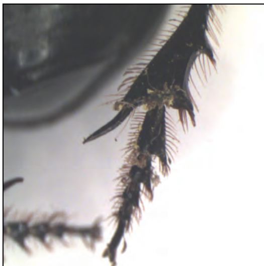
Figure 2. Metarhizium anisopliae to Orictes nasicornis female (original).

The insect was sampled from soil with a pair of tweezers and put in a entomologic jar. I took photos and transported the material to the Faculty of Biology, biology laboratory, where the specialists took samples from the surface of the insect body. After laboratory analysis was found muscardini green fungus M. anisopliae (Figs. 2, 3).