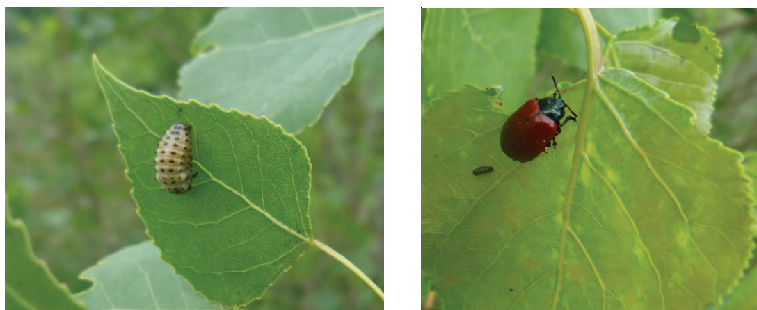
Figure 5. Larva and adult to Melasoma (Crysomela) populi (original).

This chrysomelid as well as the majority of about 50 Central-European dendrophagous species lives on species of the family Salicaceae and also often as a larva on some of them. Similarly as in many other insect pests its activity is mainly affected by moderate winters and dry and warm springs. Frequent climatic anomalies at the end of the last century and at the beginning of this century markedly affected the water balance of trees and their resistance to insect defoliators. Increased food quality (particularly the higher proportion of sugars) and favourable living conditions manifested themselves in the general increase of the population density of Chrysomelidae (including C. populi ). The species was identified in localities Bucovăț Forest- 4 specs., July 5, 2005;; Ciupereni - 1 spec. May 22, 2004; Craiova (the Botanical Garden) - 1 spec., June 20, 2005; Negoii - 7 specs., May 3, 2005; 3 specs., May 2, 2008; Secui - 1 spec., May 26, 2007 (MAICAN & CHIMIȘLIU, 2013) and in Varvoru de Jos (ILIE, 2007).