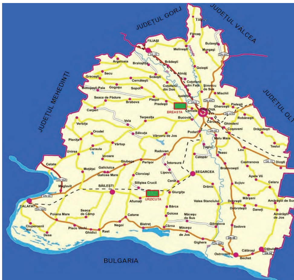
Figure 1. Urzicuța and Breasta locality in Dolj county on the map (surse google maps).

Urzicuța village is located west of the Desnățui valley, within Oltenia plain, with a plain relief represented by the Danube terraces with relative altitudes between 25 and 40 m; it is crossed by the Desnățui river in the east and Baboia creek in the south. At the base of the terraces there emerged some springs that formed a chain of pools. In the southern part of the village, there is a lake whose waters were mineralized gradually gaining therapeutic properties in the treatment of rheumatic diseases, known as "Ionele Baths". The climate is temperate continental with a minimum between 5 and -20°C and maximum values between 28 and 38°C. The average amount of precipitation is about 520 mm / year.