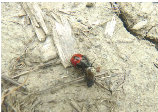
Figure 4a . Early instar nymph (the 4 th stage of development) of Zicrona caerulea preying a larva of M. populi (original).

Zicrona caerulea can reach an adult size of about 5–8 millimetres (0.20–0.31 in). The body is uniformly metallic blue-green (latin name caerulea , is blue). In the immature stage, the abdomen is red with black markings. These bugs are useful predators of leaf beetles in the genus Altica (BUG GUIDE), of larvae of various beetles and caterpillars of moths, but it also feeds on plants. Eggs are laid in spring. New adults of this univoltine species can be found from July onwards. This bug overwinters as an adult.