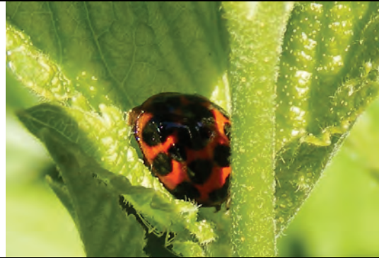
Figure 3 and 4. Harmonia axyridis on the leaves of black currant (April 23, 2015) (original).