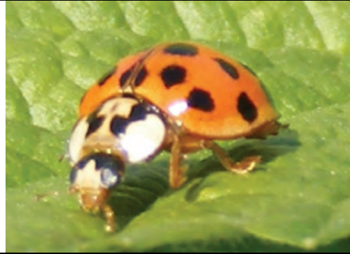
Figure 1 and 2. Harmonia axyridis on the leaves of black currant (April 23, 2011 and April 28, 2012) (original).