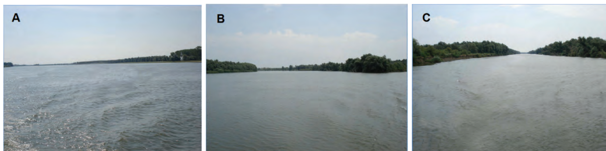
Figure 2. The sectors formed on Sfântu Gheorghe branch following the anthropogenic intervention: SN (A), MS (B), SNC (C).

The studies regarding the dynamics of the microbial communities were conducted in the three distinct regions present along Sfântu Gheorghe branch, a result of human intervention from the '80s, which aimed to improve navigation: the free-flowing sector (FS), the meander section (MS) and the newly built channel (NBC) (FLORESCU et al., 2013). The samples were taken from the water column and sediment from seven stations that correspond to the three sectors (Figs. 2; 3), in spring (April), in summer (July) and in autumn (October) in 2011-2013 period. The assessment of the intensity of the enzymatic activity was performed by substrate consumption measurement method (OBST, 1985) while the evaluation of the numerical density of physiological groups of microorganisms was performed using the method of the cultivation in vitro on specific media (PĂCEȘILĂ, 2012; 2014; PĂCEȘILĂ et al., 2013). In case of sediment, it has been reported the enzymatic activity per gram of dry substance (dry silt).