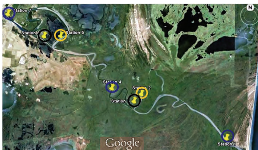
Figure 3. The sampling stations and their corresponding sectors: SN – blue colour, MS – yellow colour, SNC – black colour (after PĂCEȘILĂ, 2014).

In Romania, there are mining areas where million tonnes of mining waste have been deposited in waste dumps, on surfaces of hundreds and thousands hectares. These contain significant quantities of ores containing heavy, rare and radioactive metals that, under the influence of the physical, chemical and biological mechanisms, are solubilised. These solutes, after the migration under the influence of dump erosion (wind and precipitation) are released into the environment where they act as pollutants. The diversity of species is a parameter correlated with the degree of stability by the microorganism communities in the ecosystem. This shall be amended under the influence of physical and chemical factors from the environment. Therefore, the biodiversity measurements are useful for monitoring the changes in the pollution degree and other disruptive factors of the ecosystem contaminated with metallic ions (ZARNEA, 1994; CISMAȘIU, 2004; POPEA et al., 2004).