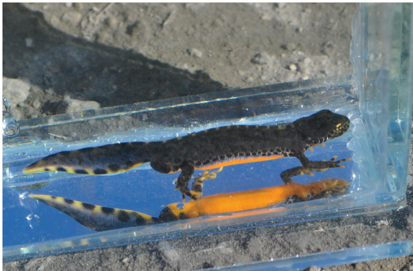
Figure 2. I. alpestris male from the habitat upstream Eșelnița (original).