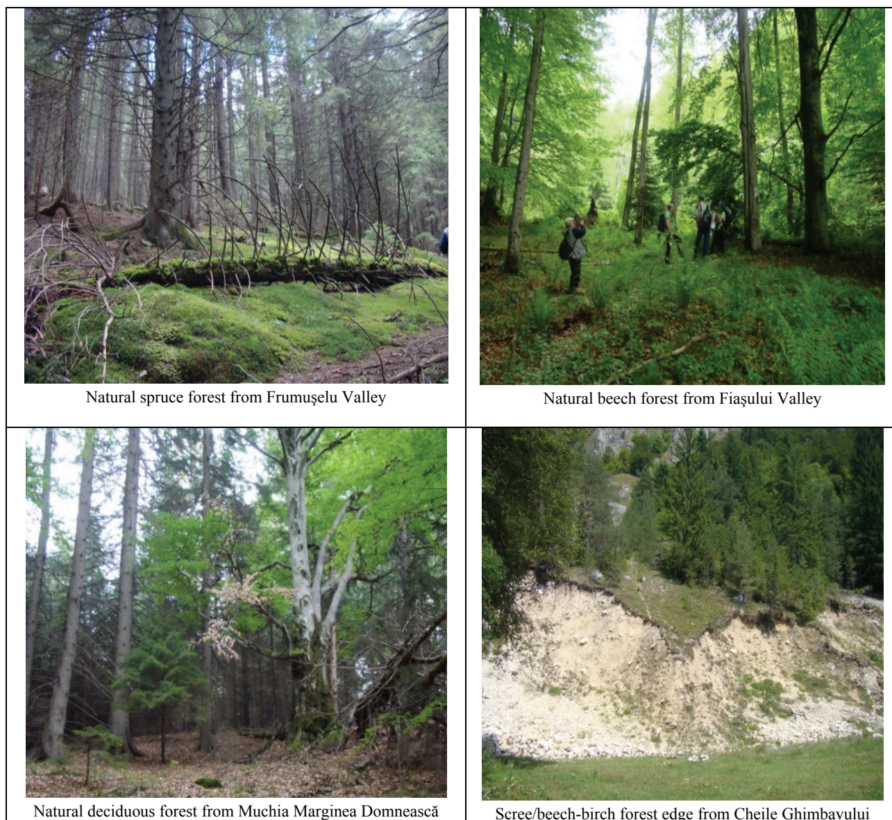
Figure 2. Investigated habitats from Leaota Mountains (original).