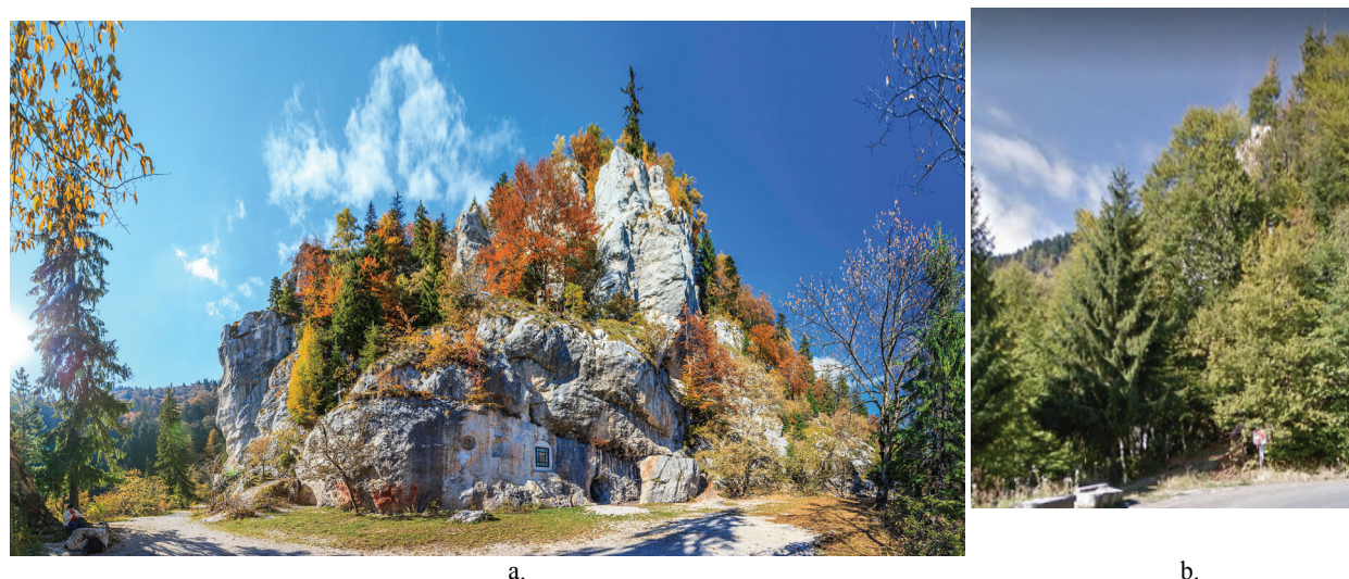
Figure 5. a - Stâncă Sfânta Ana – panoramic view, in the middle can be seen an old hermitage build in 1453 (MĂGUREANU, 2000) (Photo credit to Radu Lipșa); b - "Stâncă Izvor" – Zgarburei Valley, sight from the main road, the outcrop has vegetation cover (Google Maps, 2017).

The fourth site, "Stâncă Izvor" –Zgarburei Valley (Fig. 5b) is part of a set of rocks embedded in a limestone breccia matrix with stratiform extension in the slopes of Zgarbura Valley. This olistolith is located in a bend of the communal road 134, which goes to Cota 1400, near Davila's Spring Fountain; the marked tourist path passes right beside it, therefore it can be easily accessed by tourists. The olistolith has a height of approximately 10 m and it extends over 200 m in length. The reddish limestone of this olistolith has a fossil content that certifies the age of the Kimmeridgian - Tithonian. The fossil fauna is represented mainly by ammonites and brachiopods and rare bivalves. The limestone also contains a microfauna studied by PROTESCU (1936) and PATRULIUS (1969).