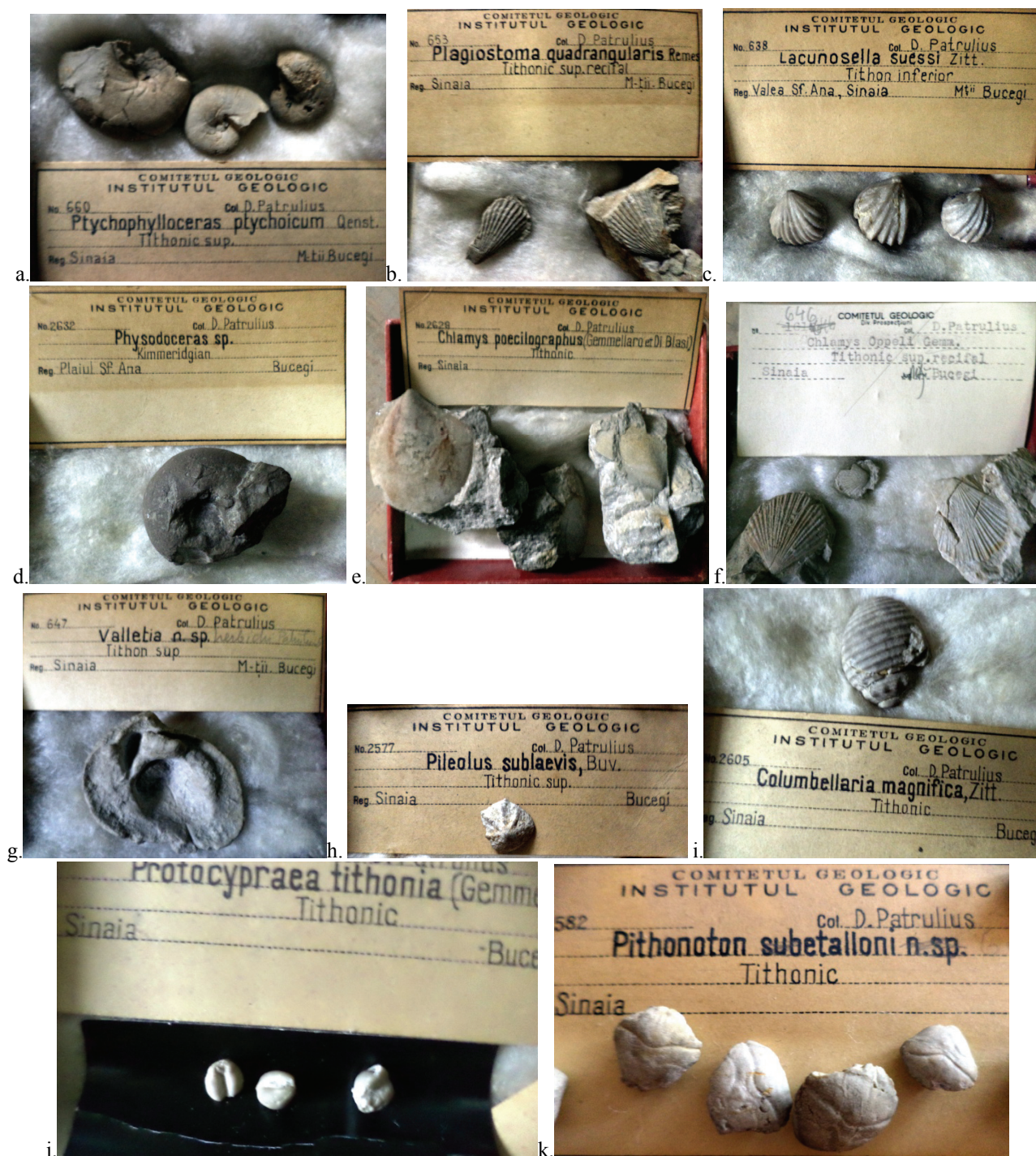
Figure 3. Images of the D. Patrușiu Collection (from the collections of the National Museum of Geology, Bucharest) from the "Stâncă Piticului" and Sfânta Ana olistolith – Upper Jurassic rocks in this perimeter of Sinaia: a, d - ammonites, b, c, e, f, g – bivalves, e – brachiopods, h, i, j – gastropods, k – crabs (original).

The limestone olistolith from the Peleş Valley displays significant faults (Figs. 4a, b) and many limestone pieces can be found on the ground, detached from the olistolith. These smaller blocks have fossils and their collection without authorization from the responsible authorities of the Bucegi Natural Park is forbidden, as stated, in a general way (without a punctual reference), in the Integrated Management Plan of the Bucegi Natural Park (R. N. Pad. Romsilva, Adm. Bucegi Natural Park, 2017). The erosion degree in the Sinaia area is medium (COCEAN et al., 2010).