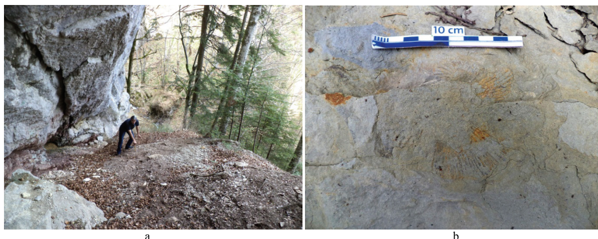
Figure 4. a - The limestone olistolith from the Peleş Valley with erosion signs, most important is a quasivertical fault of approximately 6 m (original); b - Macrocephalites sp. found near the olistolith, in grey slates (original).

The third site, Sfânta Ana olistolith (Fig. 5a), is constituted by Middle-Upper Jurassic siliciclastic and carbonate deposits with ammonites, belemnites, bivalves, echinoids, rare brachiopods and radiolarians (BECCARO & LAZĂR, 2007) (Fig. 3). Compared to the other three sites described, it is the poorest in fossils, but until present times no studies on the higher part of the site's walls have been conducted. They are possible but only by climbing routes. The site has been known since the early 19th century. It is more of a historical and geomorphologic site, but the paleontological value can't be overviewed. The exposure of the limestone in the site is very large, including the Valley of St. Ana with waterfalls; the width appraised at 400 m with a height of the walls of 60-80 m.