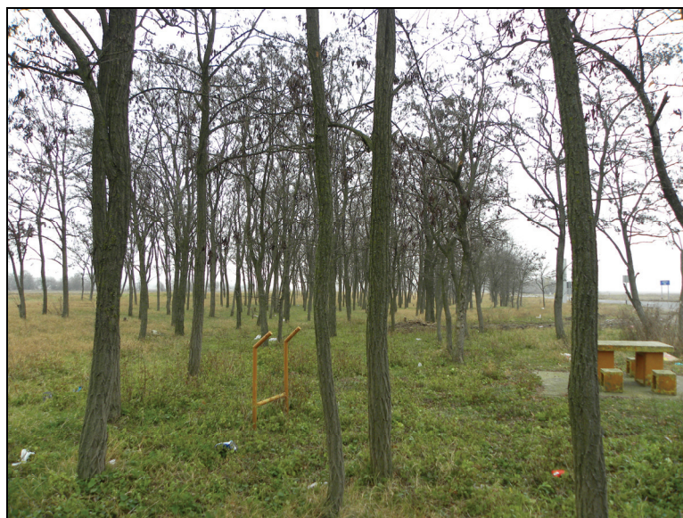
Figure 3. Xanthoria parietina on its host trees (black locust) within a shelterbelt situated near Ianca in Dolj County, along NR 54A.