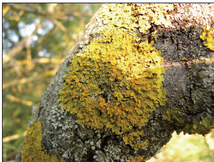
Figure 2. Xanthoria parietina on a corticolous substrata.

Generally, it was observed that the central parts of lichens have accumulated higher concentrations of heavy metals than younger parts (Table 4).