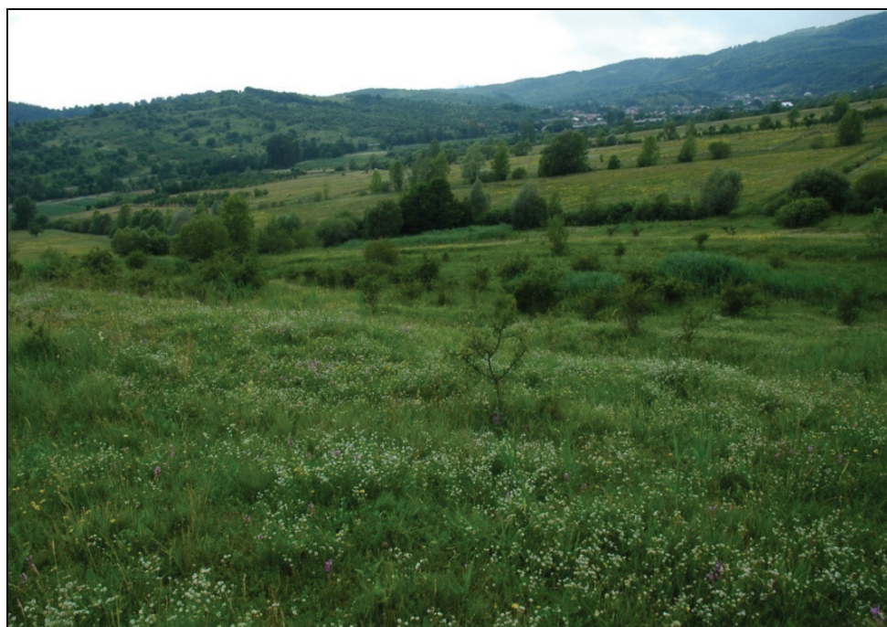
Figure 9. Grassland habitat with Dorycnium pentaphyllum Scop. – zone 4 (original).

The nitrophilous species ( Chenopodium album L., Elymus repens (L.) Gould., Amaranthus retroflexus L.) and Phragmites australis (Cav.) Trin. ex Steud. must be removed from the grasslands. According to MARUȘCA et al. (2014) it is not recommended to fertilize the oversheep-folding grasslands (zone 3 in our study) until the excess of nitrogen and potassium is exhausted.