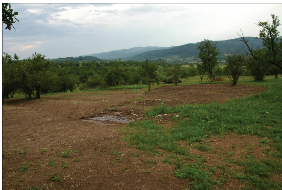
Figure 7. Surfaces without vegetation – zone 3 (original).

Stereo '70 coordinates: N - 413328,66; E - 492663,05 (Fig. 8); Altitude: 555 m