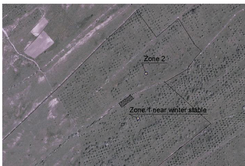
Figure 4. Orthophotomap with the addition of point 2 (original).

The floral composition is made up of typical species for mountain meadows but with a reduced size due to grazing. These include Holcus lanatus L., Agrostis capillaris L., Cruciata glabra (L.) Ehrend., Dorycnium pentaphyllum Scop., Ononis arvensis L., Agrimonia eupatoria L., Leucanthemum vulgare (Vaill.) Lam., Stachys officinalis (L.) Trevis., Filipendula vulgaris Moench, Trifolium pratense L., Briza media L., Lotus corniculatus L., Ranunculus sardous Crantz, Pimpinella saxifraga L., Linum catharticum L., Centaurea phrygia L. ssp. pseudophrygia (C. A. Mey.) Gugler, Medicago lupulina L., Veronica arvensis L., V. chamaedrys L., Achillea millefolium L., Elymus repens (L.) Gould., Echium vulgare L., Stellaria graminea L., Thymus pulegioides L., Symphytum officinale L., Convolvulus arvensis L., Poa annua L., Plantago media L., P. lanceolata L., Rhinanthus minor L., Knautia arvensis (L.) Coult., Cirsium canum (L.) All.. Sporadically small specimens of Phragmites australis (Cav.) Trin., Ambrosia artemisiifolia L., Xanthium strumarium L. appear. Also, in the perimeter of this area, shrubs of Rosa canina L. and Crataegus monogyna Jacq. grow.