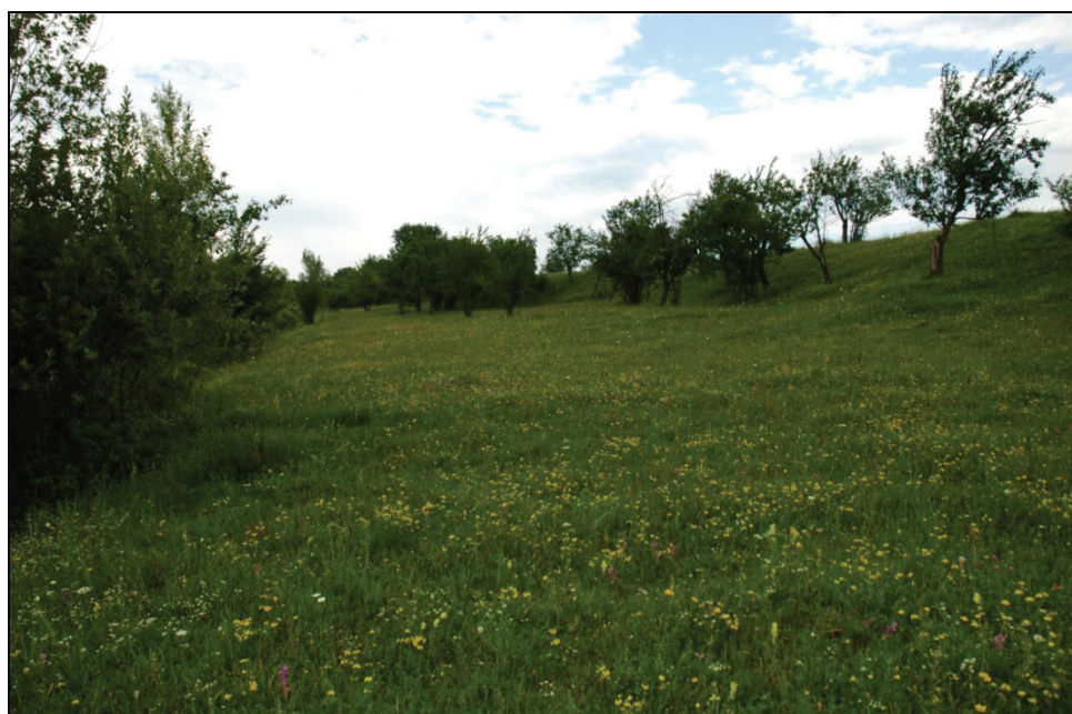
Figure 5. Grassland habitat – zone 2 (original).