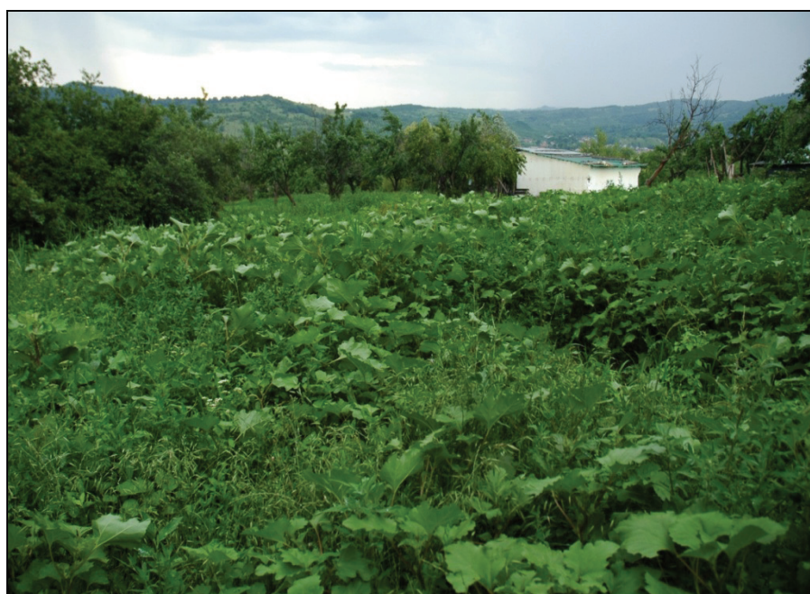
Figure 3. Pasture habitat invaded by Xanthium strumarium L. – zone 1 near winter stable (original).