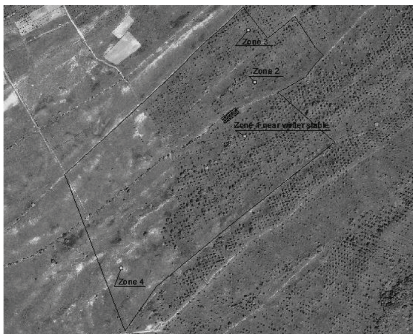
Figure 8. Orthophotomap with the addition of point 4 (original).