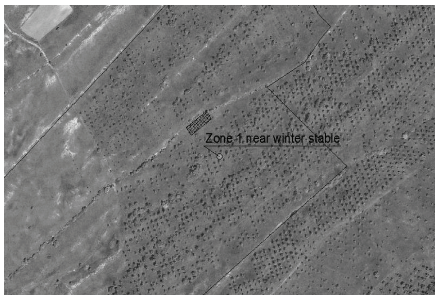
Figure 2. Reporting point 1 on orthophotomap- winter stable (original).

Due to the anthropozoogenic activities in this perimeter, areas with weeds were formed, like: Xanthium strumarium L., Bromus sterilis L., Capsella bursa-pastoris (L.) Medik., Erigeron canadensis L.. Besides these, specimens of Ambrosia artemisiifolia L. have been observed, which is sporadic and its ability to spread is limited because it is mown before flowering and fructification.