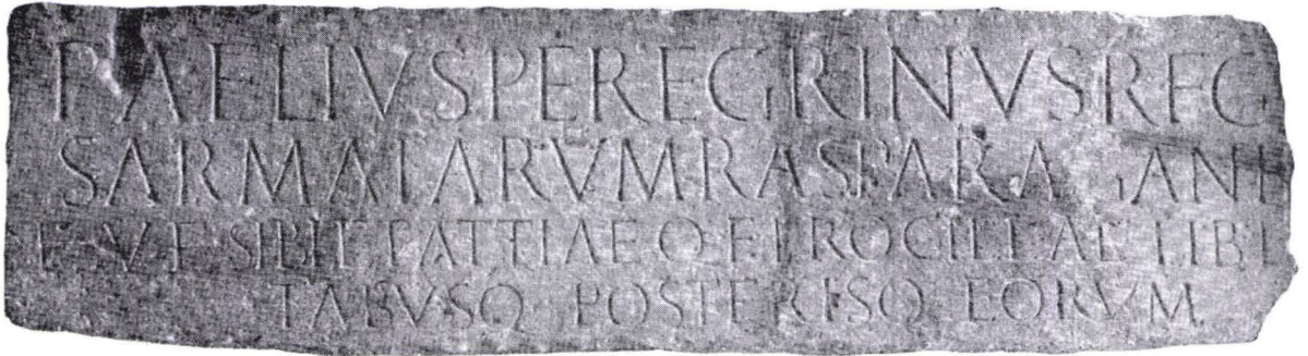
Fig. 3. Inscription (I.I. X71,153)

P(ublius) Aelius Peregrinus, regis Sarmatarum Rasparagani filius, vivus) fecit sibi et Atiae Quinti filiae Procillae, libertis Faber tabusque) posterisque) eorum