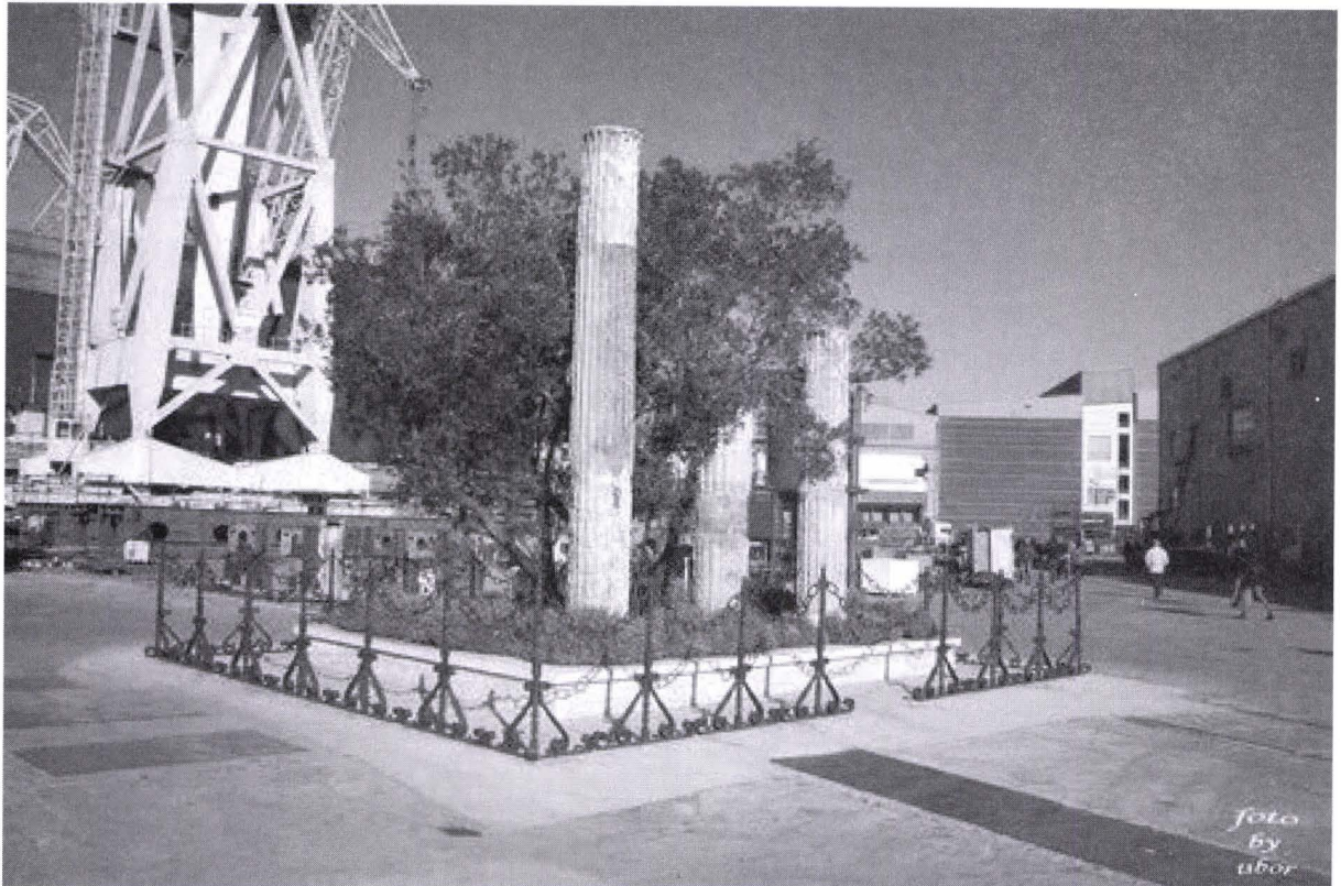
Fig. 5. Olive Island – Uljanik, remains of Roman ruins