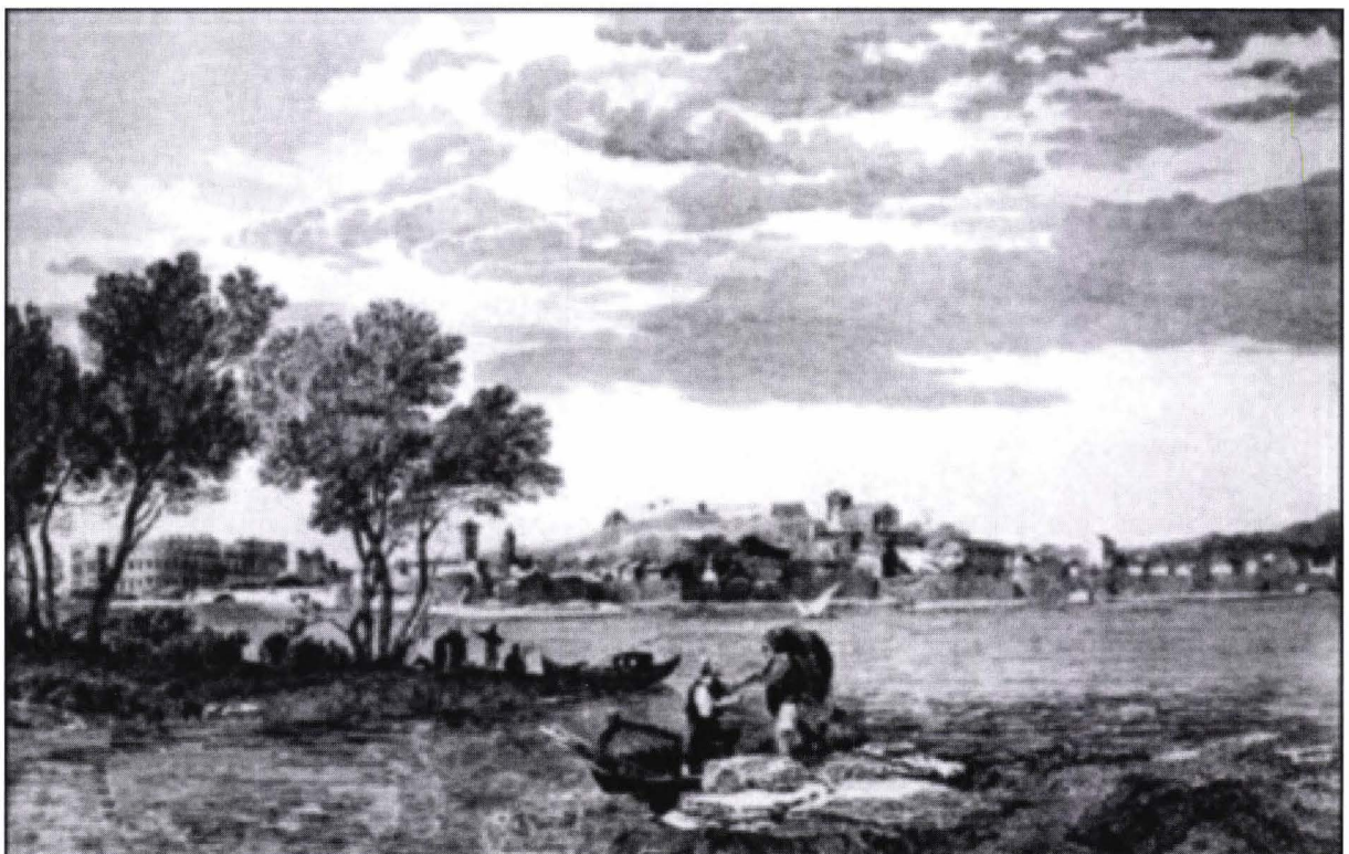
Fig. 2. Pula, harbor by Th.Allason (archive V.G.J.)