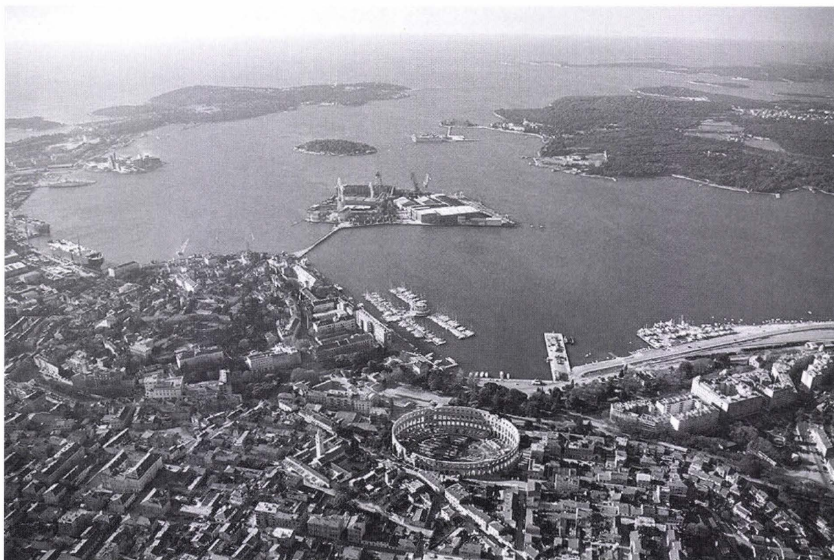
Fig. 6. Pula, the view, Olive Island – Uljanik in the middle