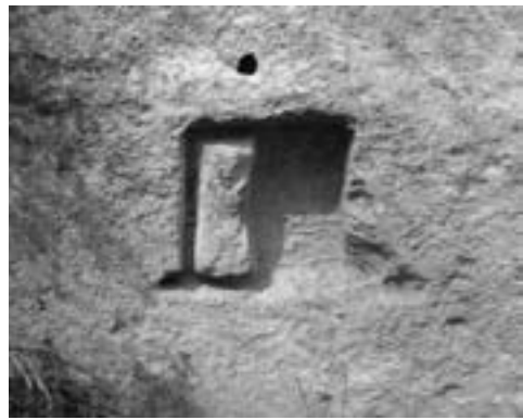
Fig. 7. The niche with the triangular ram head, symbol of the worship of Apollo Carneios

be found from the middle of the 5<sup>th</sup> century BC in the whole Greek world. Their main characteristic is that they are almost all located next to areas with subterranean or over ground water streams. In Kythera the name of the sanctuary's location itself, Loutro (= bath), reassures it. There is a subterranean watercourse in this location that supplies the monastery with water until today.