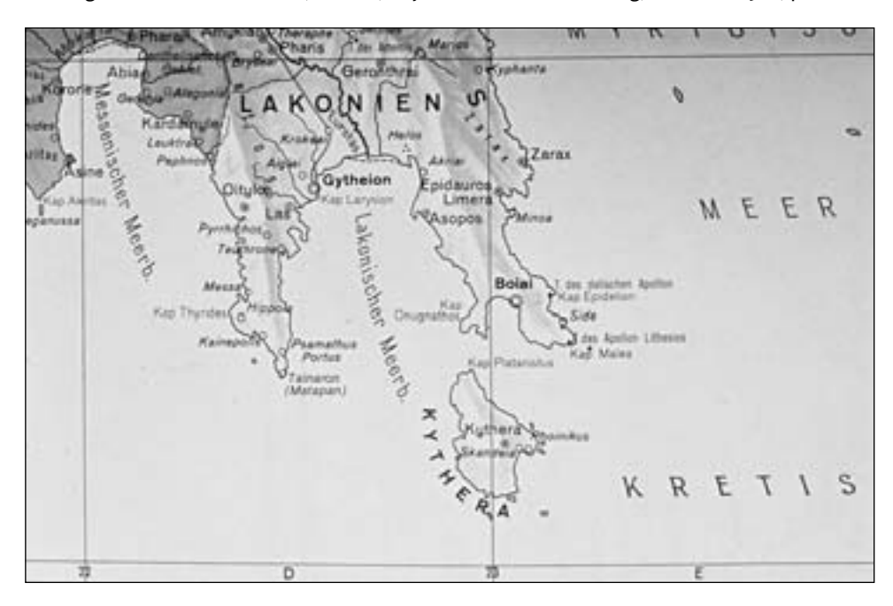
Fig. 2. Lakonia and Kythera. (Großer Historischer Weltatlas, 1. Teil, Vorgeschichte und Altertum, 6. Aufl., Bayrischer Schulbuch-Verlag, München 1978, pl. 26).