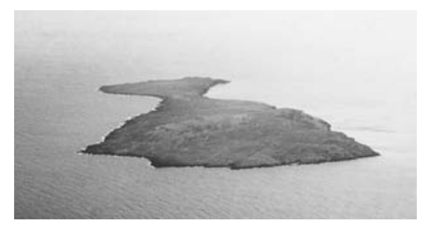
Fig. 8. The islet of Mikri Dragonara as is seen from Kythera.

Poseidon, as Gaieochos (earthshaking) was worshipped in Sparta as the god of earthquakes and except for the city itself where a temple dedicated to Poseidon was located, there was also an important sanctuary in the Tainaron cape, where the great market of mercenaries was gathered (Diodorus 17.111.3) at the time.