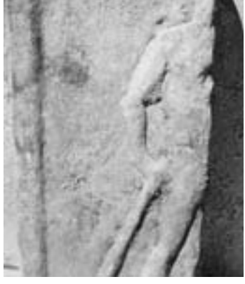
Fig. 4. The sanctuary of Heracles in the limestone quarry.