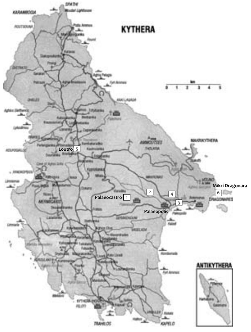
Fig. 3. Map of Kythera with the location of the ancient sanctuaries found on the island: 1. sanctuaries of Aphrodite (?) and Dioscouroi, 2. sanctuary of Alaia, 3. sanctuary of Herakles 4. sanctuary of Apollo Carneios, 5. sanctuary of Asklepios, 6. sanctuary of Poseidon Gaieochos.

After a rescue excavation that took place in 1999 in the area of Palaeopoli (fig. 3/2), in close vicinity to ancient Skandeia, where the ancient harbour of Kythera was situated, an open roofed cave was found where a sanctuary dedicated to Alea (Tsaravopoulos 1999, 261-264; M \chi άλακας 2000, 91-100) was located. Alea was a pre-Hellenic goddess worshipped in Arkadia and Laconia, who in the Hellenic twelve god pantheon became "Alea" Athena. Very well known is the temple of "Alea" Athena in ancient Tegea, in Arkadia dating to the 4th century BC. It is also known that an important temple in the city of Sparta was dedicated to "Alea" Athena.