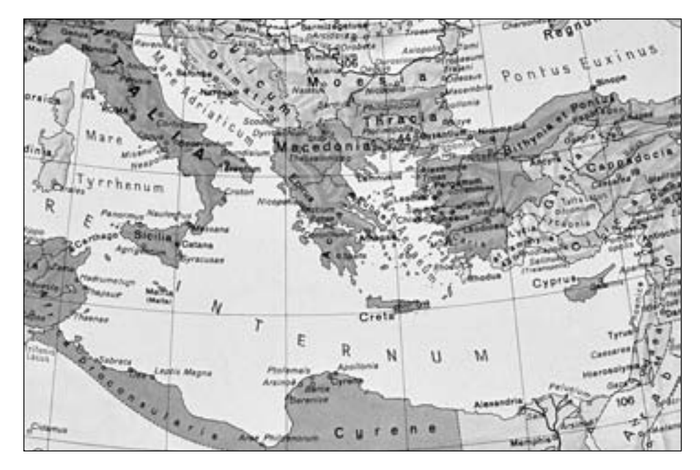
Fig. 1. The island of Kythera in the Mediteranean Sea. (Großer Historischer Weltatlas, 1. Teil, Vorgeschichte und Altertum, 6. Aufl., Bayrischer Schulbuch-Verlag, München 1978, pl. 44.