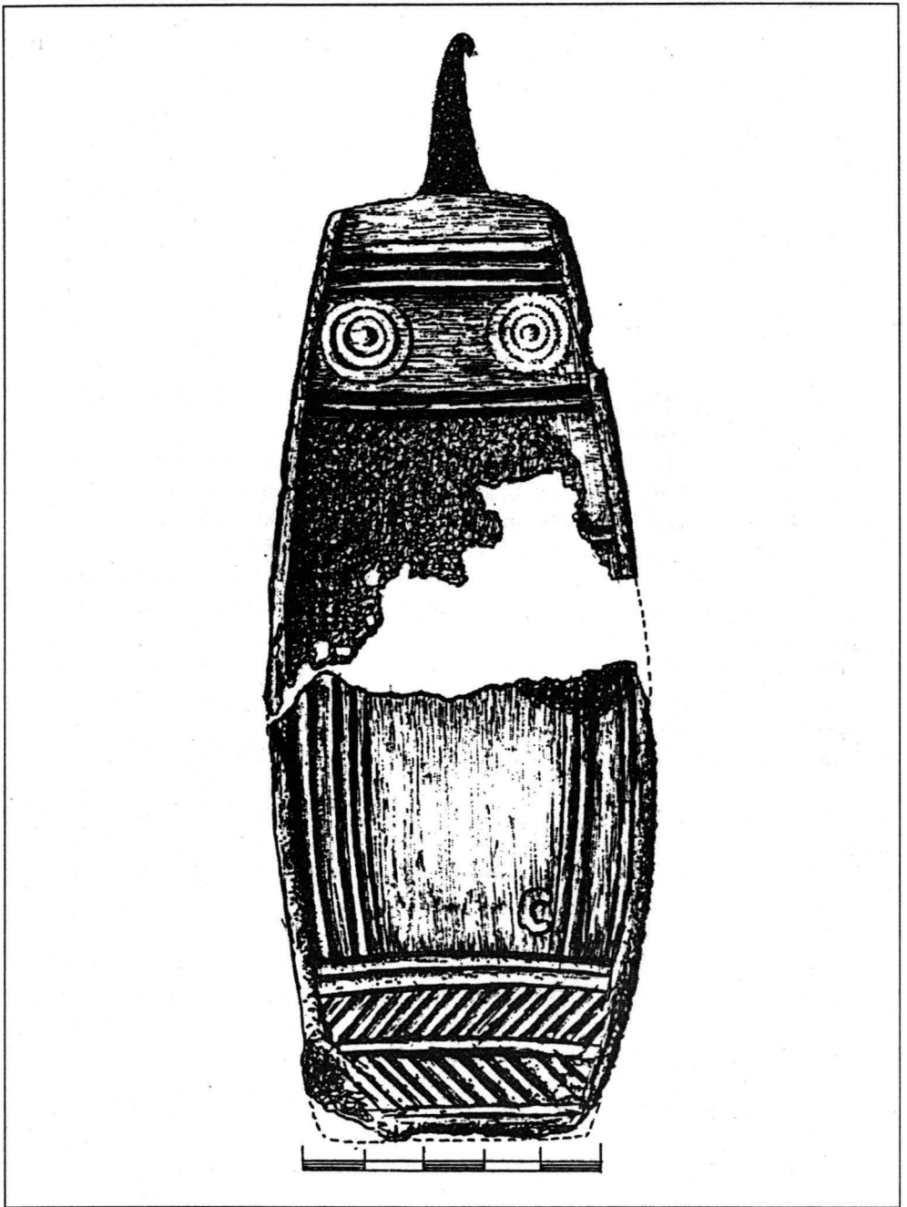
Fig. 1. Buckle from Apoulon - Piatra Craivii