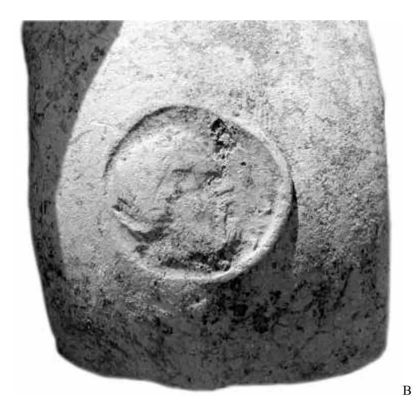
Fig.\ 5.\ A,\ B-Stamps\ on\ Thasian\ amphorae\ from\ Pistiros:\ heads\ of\ Satyr.