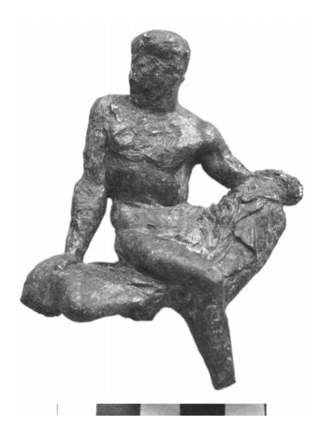
Fig. 4. Bronze statuette of a young Satyr; appliqué of a bronze vessel (?).