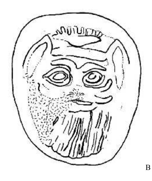
Fig. 2. A, B – Satyr head imprinted on a local pitcher