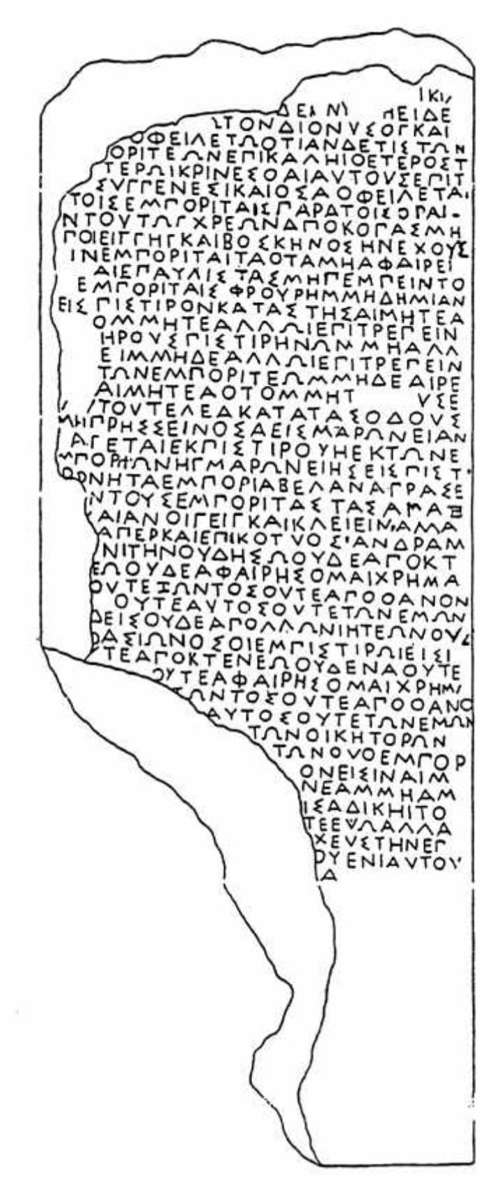
Fig. 1. The Pistiros inscription, the contract between Kotys and the emporitai was closed under the patronage of Dionysus.