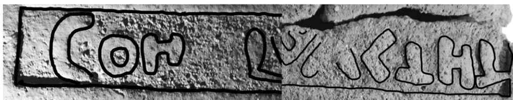
Fig. 2. The complete recent stamp impression (after Karasiewicz-Szczypiorski, Mamuladze, Speidel 2022).

With the help of such fragments, it is possible to arrange a composite image of the complete original stamp impression (Fig. 2):