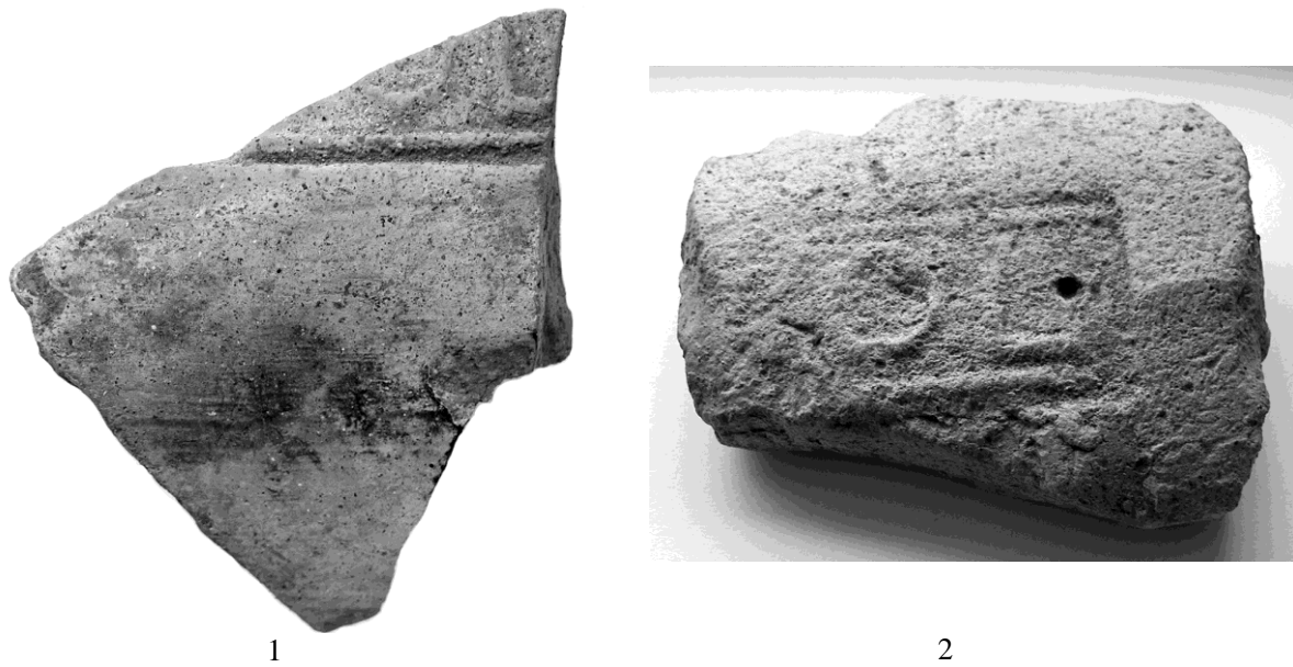
Fig. 4. 1-2. Fragmentary tile stamps of legio XV Apollinaris .

The military nature of the find spot and the Latin letters leave little doubt that we are dealing with fragments of tile stamps produced by a military unit. Most likely, this was legio XV Apollinaris , the legion stationed nearest to Apsarus. This legion was transferred to Satala in Armenia Minor (and thus to the command of the Roman governor of Cappadocia) at the beginning of Hadrian's reign, and is still attested there at the end of the fourth century. 19 At its base at Satala, the legion produced similar tile stamps reading LEGXV APOL (Fig. 6): 20