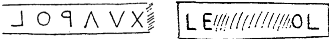
Fig. 5. Tile stamps of legio XV Apollinaris from Satala (Mitford 1997, 142 nos. 5 and 2).

The military nature of the find spot and the Latin letters leave little doubt that we are dealing with fragments of tile stamps produced by a military unit. Most likely, this was legio XV Apollinaris , the legion stationed nearest to Apsarus. This legion was transferred to Satala in Armenia Minor (and thus to the command of the Roman governor of Cappadocia) at the beginning of Hadrian's reign, and is still attested there at the end of the fourth century. 19 At its base at Satala, the legion produced similar tile stamps reading LEGXV APOL (Fig. 6): 20