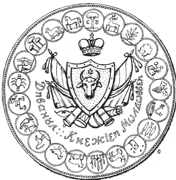
Fig. 14. Seal of the Council of the Principality of Moldavia (1806-1812)