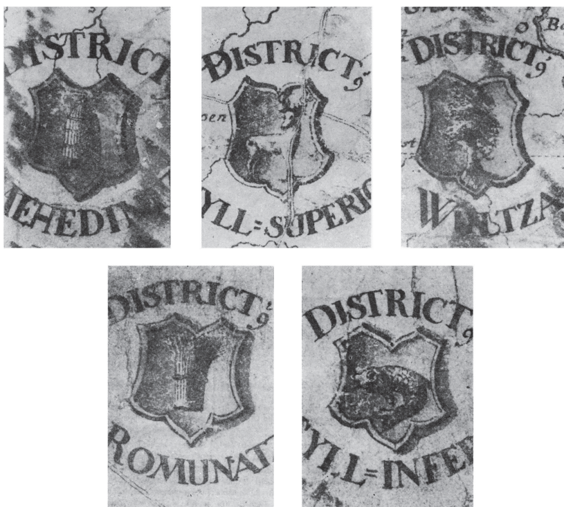
Fig. 12. Coats of arms of the five counties of Oltenia (Mehedinți, Gorj, Vâlcea, Romanați, Dolj), under the Austrian rule (upon a map by Fr. Schwantz, 1722)