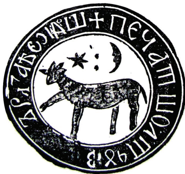
Fig. 5. Seal of the city of Iași (1712)