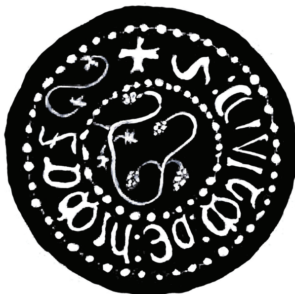
Fig. 10. Seal of the town of Neamț (1599)