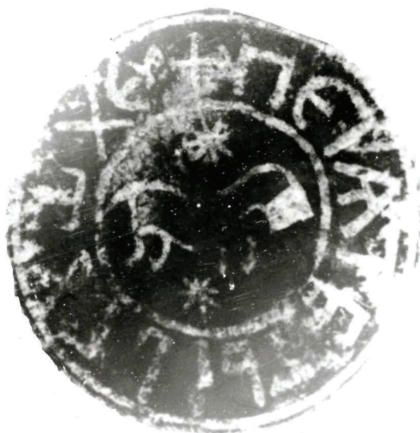
Fig. 6. Seal of the town of Orhei (1655)