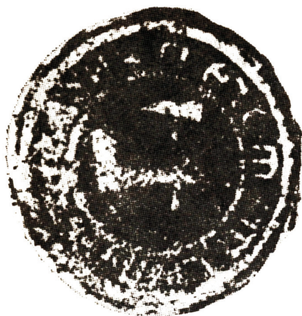
Fig. 11. Seal of the town of Trotuș (1650)