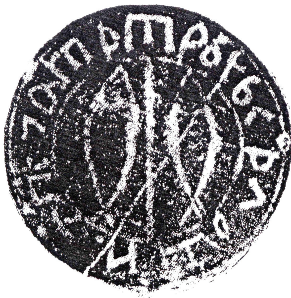
Fig. 3. Seal of the town of Galați (1643)