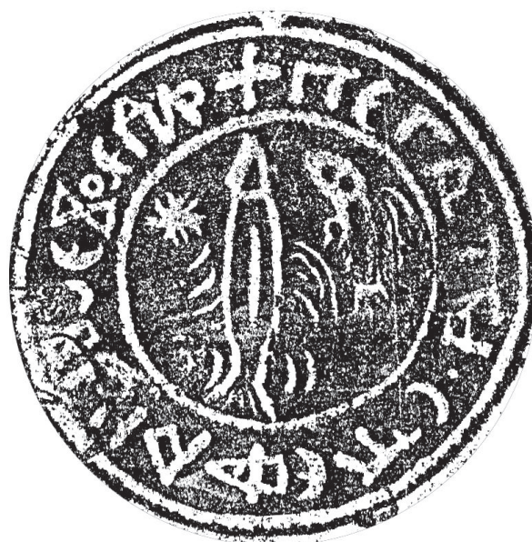
Fig. 2. Seal of the town of Vaslui (1641)