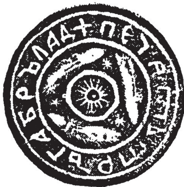
Fig. 1. Seal of the town of Bârlad (1635)