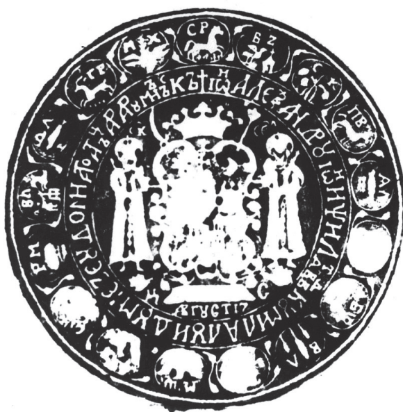
Fig. 13. Great seal of Alexander Ipsilanti, prince of Wallachia, with the symbols of the counties around the princely coat of arms (1797)