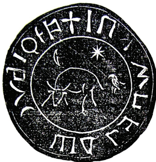
Fig. 4. Seal of the city of Iași (1649)