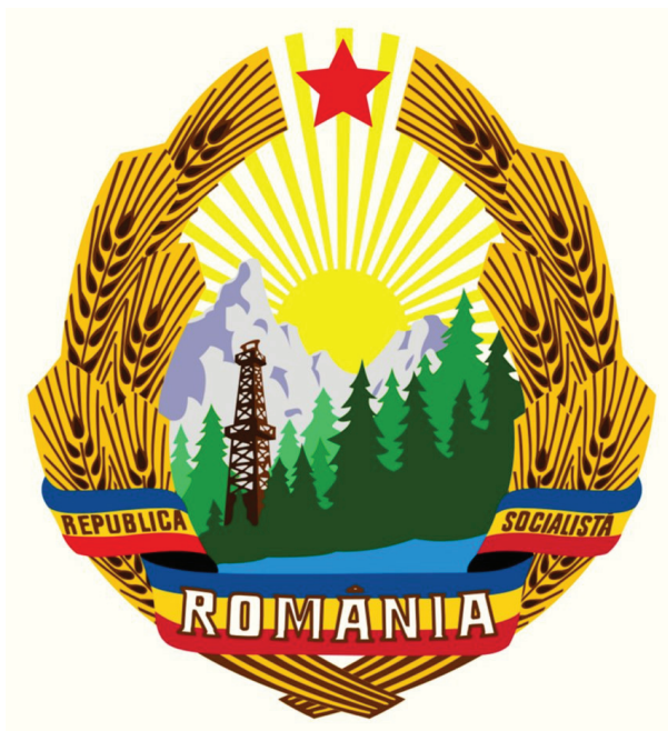
Fig. 15. Coat of arms of the Socialist Republic of Romania (1965-1989)