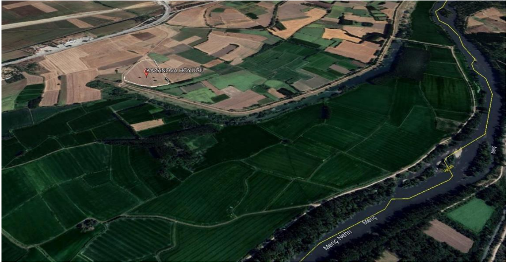
Fig. 2. Location of Kazanova Mound (Edited from Google Earth).