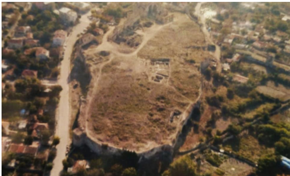
Fig. 7. General view of Enez (Ainos) Castel (Edirne Museum).

The former excavation director from Ainos, S. Başaran, pointed out that the dark grey, monochrome, burnished shards found in the fill on the bedrock surface, in Trenches IV, IVa-b, Mzü, H, and D in Enez Castle (the acropolis of the ancient city of Ainos), resemble the 2 nd millennium BC pottery known from Thrace, Western Anatolia and the Troy region, in terms of paste, form and decoration 10 . Unfortunately, no examples of these ceramics were identified during the excavations in the Ainos excavation storage room. However, some wheel-made dark grey paste and burnished bazzi ceramics examined in the repository show significant similarities with the handmade pottery of the Early Iron Age. This proves that some ceramic practices representing the 7 th century BC culture in Ainos continued the Early Iron Age tradition.