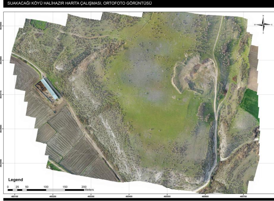
Fig. 4. 3D Model View of the Suakacağı settlement.

In addition, the site from Kokarca, which is situated outside the main corridor of this valley, but which we consider in the same group due to its proximity to the valley, seems to have been a very important settlement. Unfortunately, as it was massively affected due to the construction of a pond, it is difficult at present to ascertain the exact nature of the site. Still, the high quality of some of the pottery found at the surface suggests that the site from Kokarca may be a Late Bronze/Early Iron Age cemetery. Some of the shards recovered from the site clearly show the cultural connection of this centre, located on the foothills of the mountainous area in the northern part of Turkish Thrace, with Northern Thrace and the Southern Carpathians.