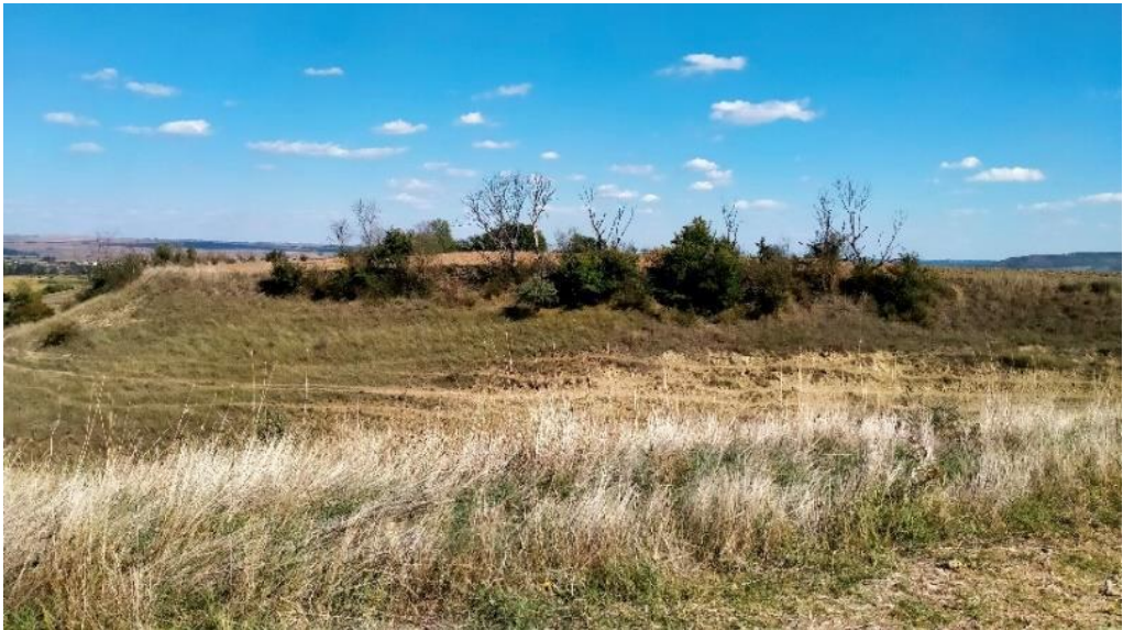
Fig. 3. General view of Ala Tepe Settlement from West.