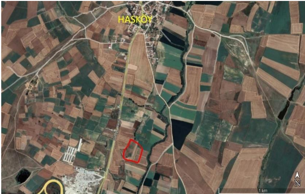
Fig. 6. Satellite view showing the approximate boundaries of the Cevizlik Settlement (Edited from Google Earth).

maritime traffic line providing access to the Gallipoli peninsula and the northern Aegean islands. The Hisarlı Mountain, which extends parallel to the coastline in the east-west direction, complements the geographical landscape of the region. There are wide oval plains between the large and small hills in the area south of the mountain. These geographical traits of the region, together with the important water resources, have proved beneficial for the continued inhabitation of the area and supported the existence of settlements during the Iron Age.