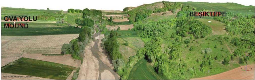
Fig. 8. 3D Model View of Beşiktepe and Ovayolu Settlements.

In addition, a small area on the eastern skirts of the Batak Degirmen Mound, located at the intersection of two small streams in the northwestern part of the Tozaklı Valley, yielded a small number of finds dated to the Early Iron Age.