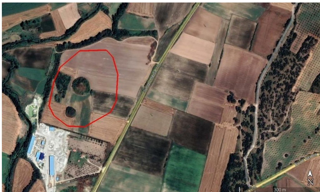
Fig. 5. Satellite view showing the approximate boundaries of the Kocatepe Mound.

The settlement from Cevizlik (Fig. 6) in the Hasköy Valley is a centre that was investigated in previous years 8 but has been re-verified by us. The Cevizlik settlement, which seems to have spread over a much larger area compared to many other Early Iron Age settlements known in the region, may be one of the key settlements in terms of regional archaeology.