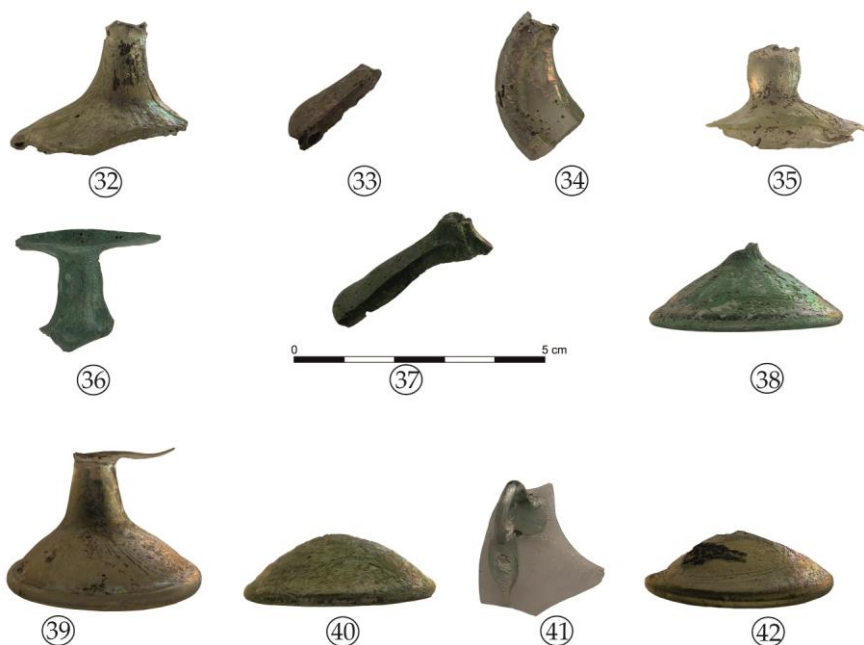
Fig. 2. Fragmentary stemmed goblets from the Acropolis Centre-South Sector (Histria).

Analogies: Țârlea, Cliante 2020, Cat. No. 29