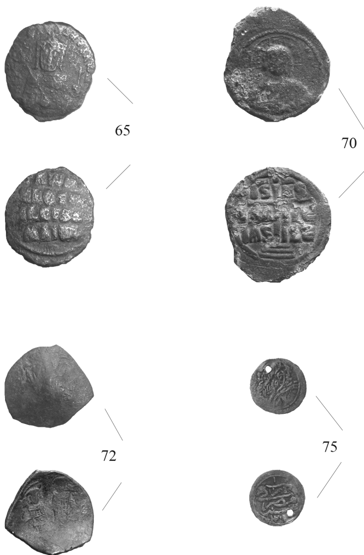
Plate II / Scale 1:1