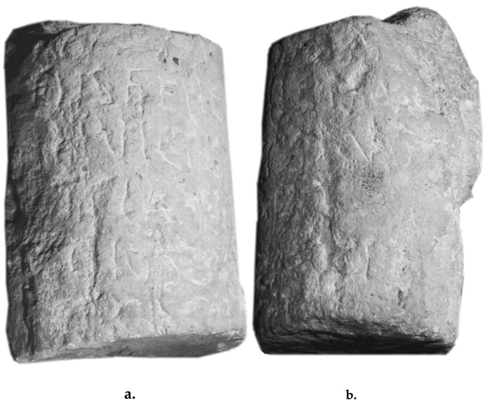
Fig. 4 a-b