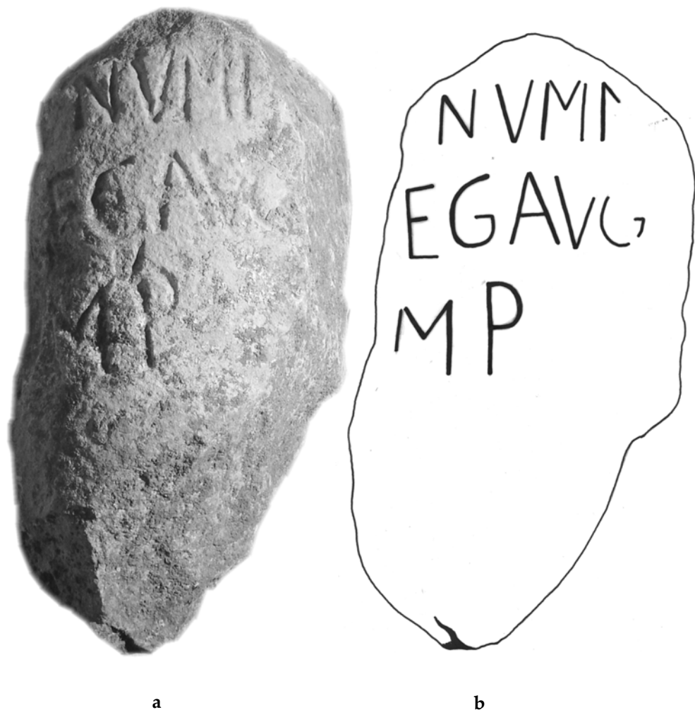
Fig. 1 a-b