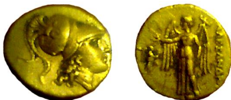
Fig. 1. Alexander the Great stater from Corinth

standing to the right with wreath and palm. We have only the photo of the coin, but no technical data about it; however, because of its high degree of rarity and because of the remarkable historical importance we decided to publish it anyway.