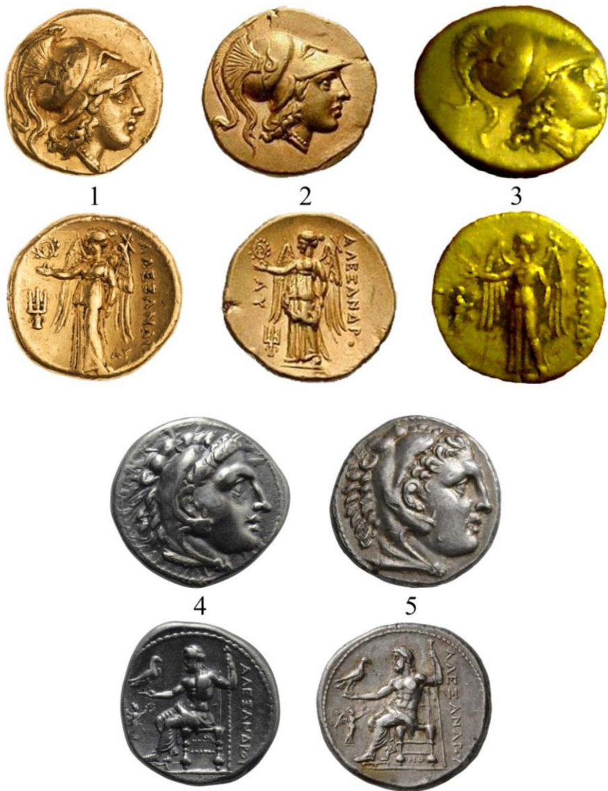
Pl. I. Alexander type staters and tetradrachms from Corinth having Nike as symbol: 1. ANS 1944.100.38430 (1,5×1); 2. CNG, Male Bid Sale 57, April 4 th 2001, lot 175 (1,5×1); 3. Private collection (1,5×1); 4. Numismatik Naumann, Auction 70, 7 October 2018, lot 70; 5. Leu Numismatik AG, Web Auction 1, 25 June 2017, lot 302.