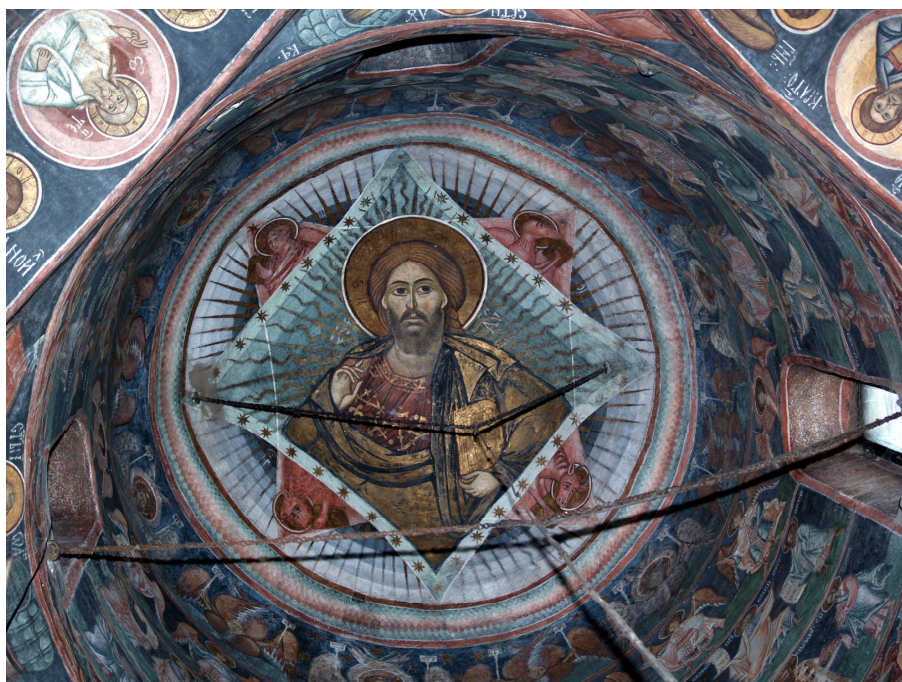
Fig. 1. Church of St. George, Voroneț monastery, Christ Pantocrator in the dome of the naos