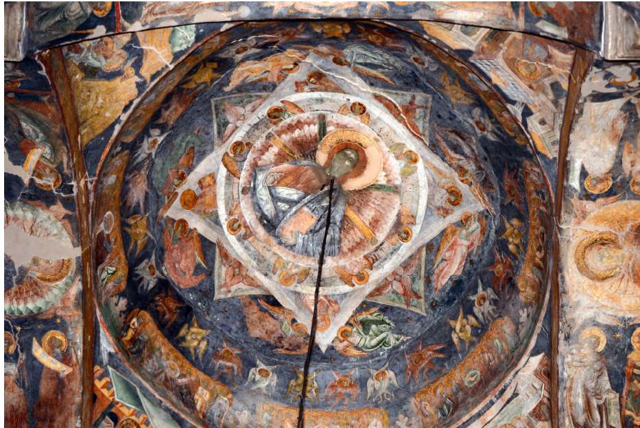
Fig. 5. Church of the Beheading of John the Baptist in Arbore village, dome of the naos (photo: the author).