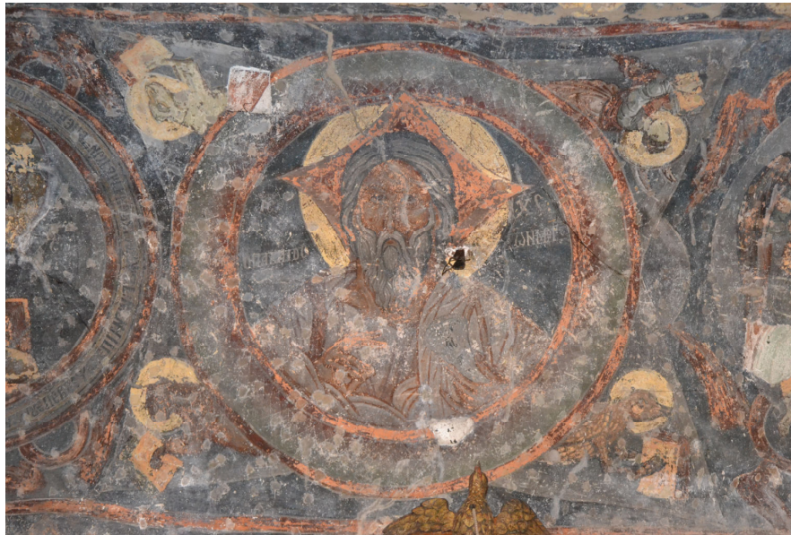
Fig. 10. Bogorodica Bolnička, the transversal vault of the nave, detail of the Ancient of Days with the symbols of the Evangelists.