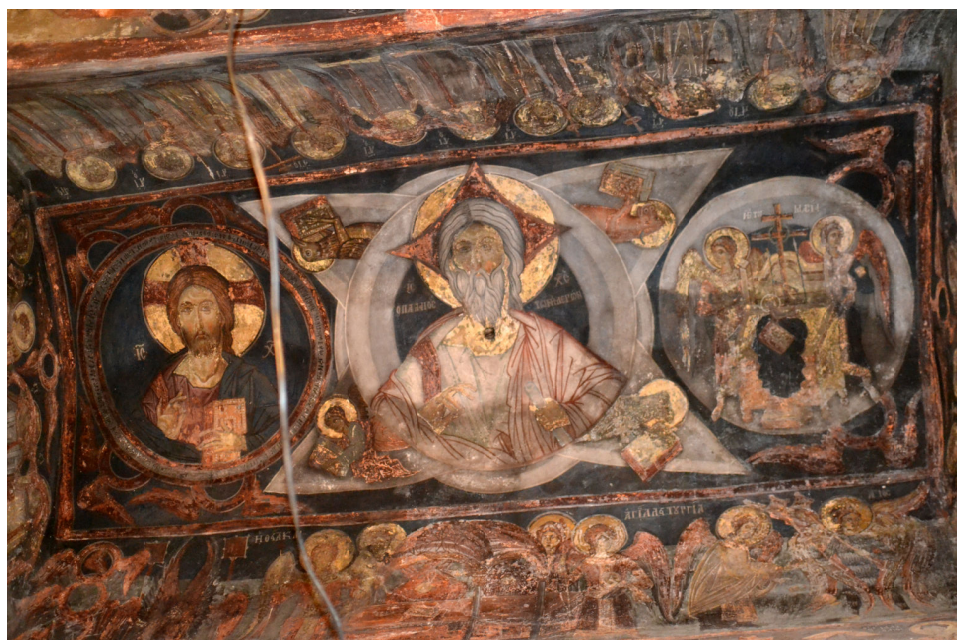
Fig. 9 b. St. Constantine and Helen church, the transversal vault of the nave.