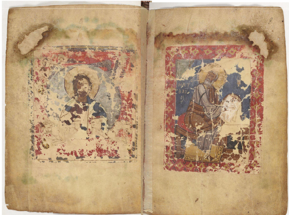
Fig.7. Paris Bibl. Nat. Gr. 81, fol 7 v , fol 8 r.