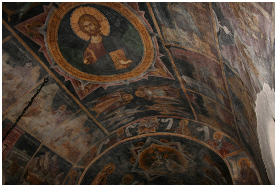
Fig. 8 a. Hospital church of Bistrița monastery, barrel vault of the naos.