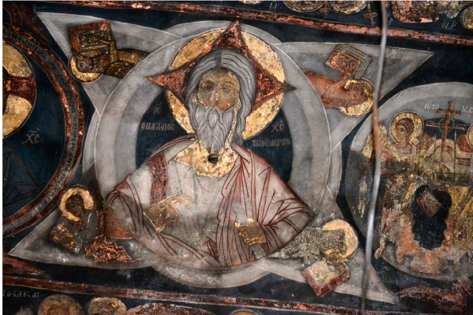
Fig. 9 a. St. Constantine and Helen church, the transversal vault of the nave.