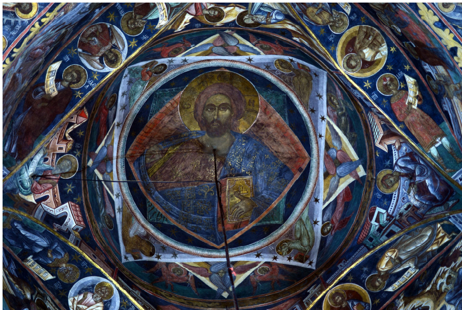
Fig. 4. Church of the Dormition of the Mother of God in the Humor monastery, dome of the naos.