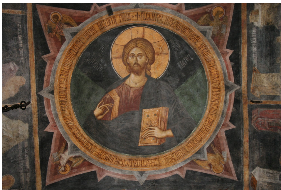
Fig. 8 b. Hospital church of Bistrița monastery, barrel vault of the naos (photo: Vlad Bedros).