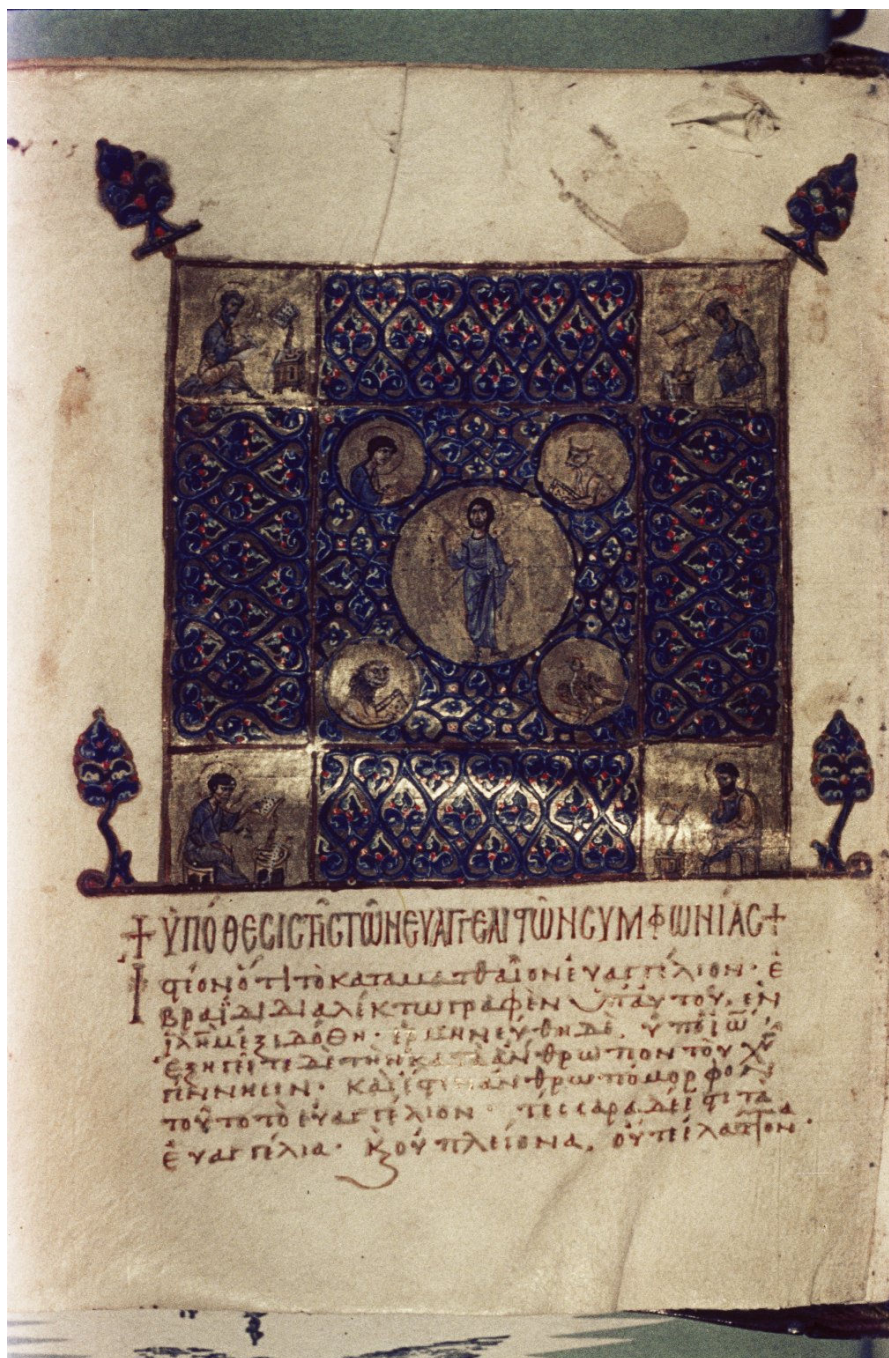
Fig. 6. Oxford, MS. E. D. Clarke 10, fol. 002 v