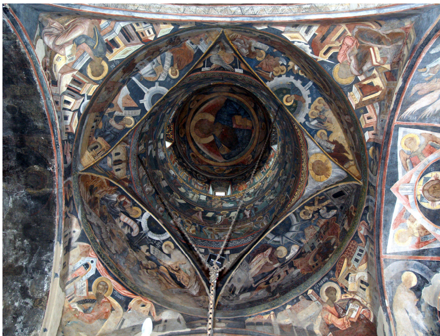
Fig. 11. Church of St. George in the monastery of John the Neomartyr from Suceava, dome of the naos.