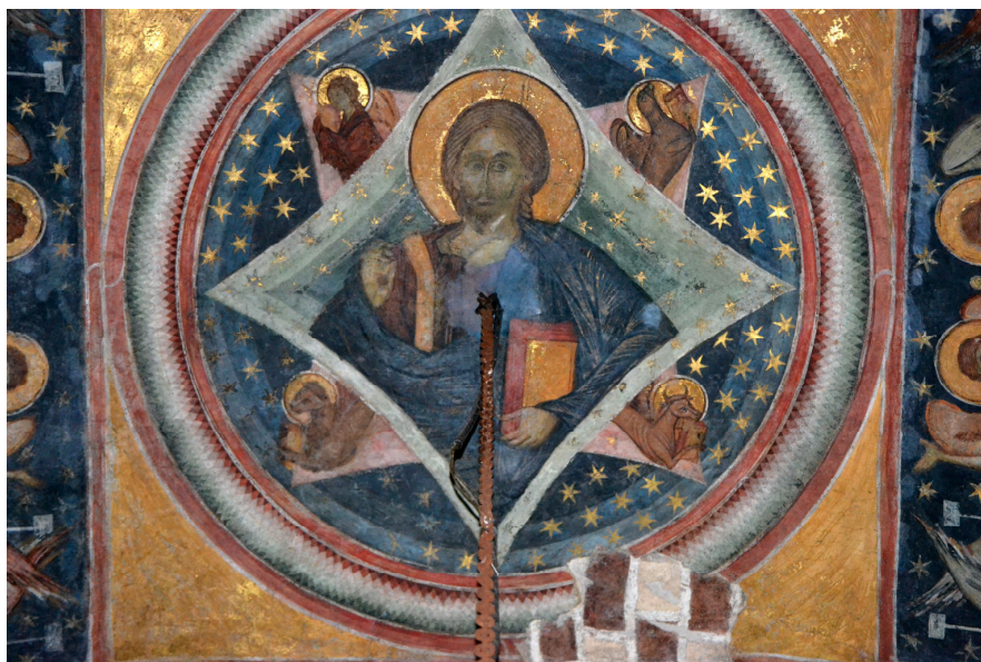
Fig. 2. Church of St. Nicholas in Bălinești village, Christ Pantocrator, vault of the naos.