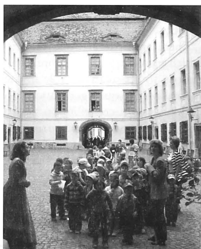
Guided tour to the Brukenthal Palace