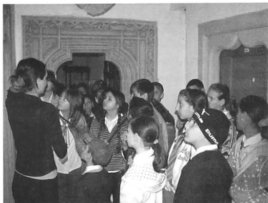
The guided tour