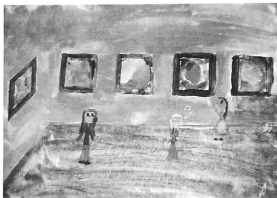
Visitation circuit in a 3 rd grade student's work