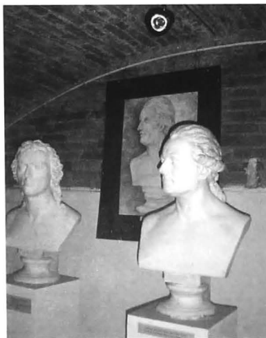
The exhibition of the resulted works

The drawing study after plaster-cast copies is a stage in learning the artistic representation of human figure, involving the page framing, the understanding and the covering in light and shadows of the represented subject.