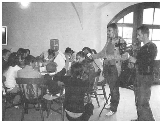
The creativity workshop

The iconography of angels and the opening of the exhibition in December – time preceding Christmas – occasioned the experience of referring to the community's values.