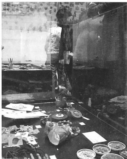
The exhibition on spring symbols

theoretical stage of 4 lectures on ecology, delivered by the Museum's curators, the trainees being 45 teachers from rural kinder gardens. There were also two following practical stages, the teachers organizing two series of workshops with the children: "Spring symbols made out of recycled materials" and "A vegetal alternative in egg-painting" as the result of which 2