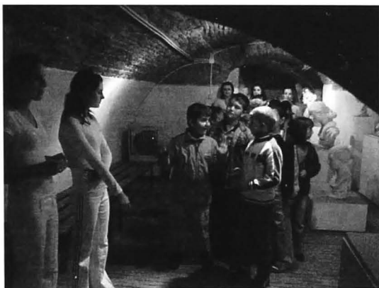
Guided tour to the Plaster-cast Copies Exhibition

project was the result of the partnership between the Brukenthal National Museum and the Art High School in Sibiu, enjoying the participation of 10 th grade, Graphics Department.