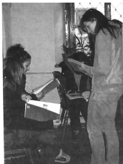
Students with the exhibition catalogue

The educational project of Brukenthal National Museum and the Art High School in Sibiu introduce, along with the institutional cooperation, a spiritual approach and a disposition for ecumenism, offering students a new perspective in comparison with the common patterns in their activity.