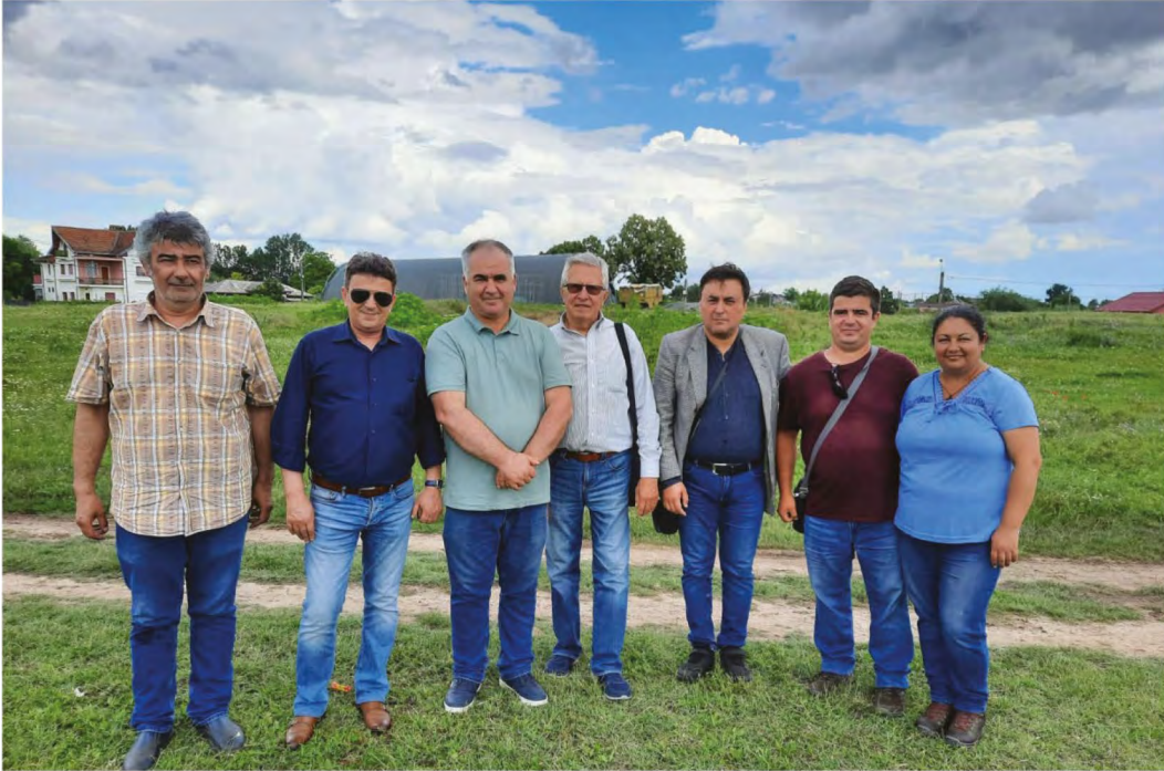
Reșca-Romula. During the archaeological campaign of 2021