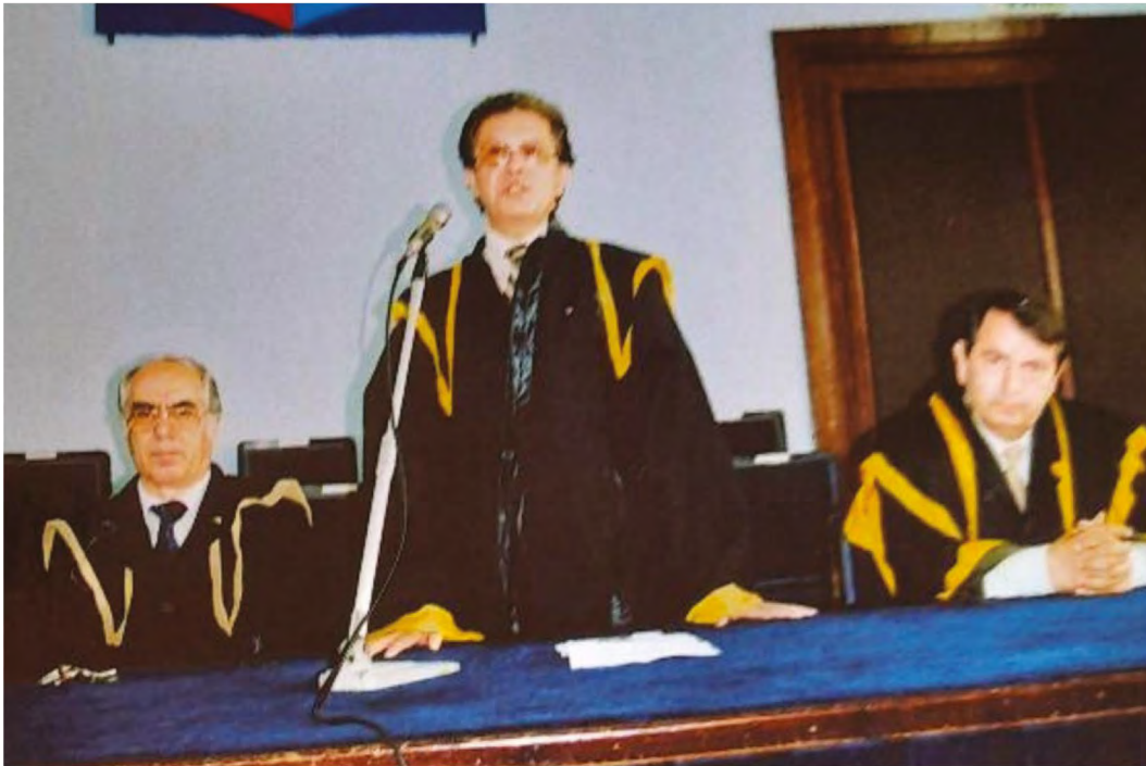
University of Craiova, Blue Room. Graduation ceremony of students, series of graduates of 2004