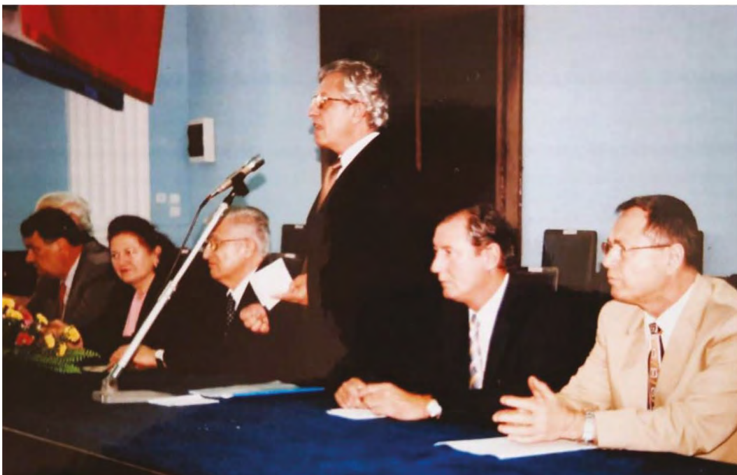
University of Craiova, Blue Room. Opening ceremony of the academic year 2007-2008