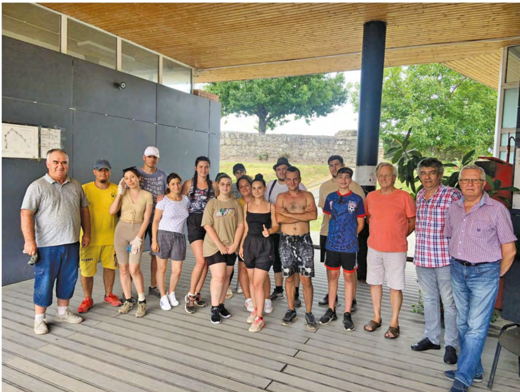
Celei-Sucidava. During the practical training of the 2022 series of undergraduates