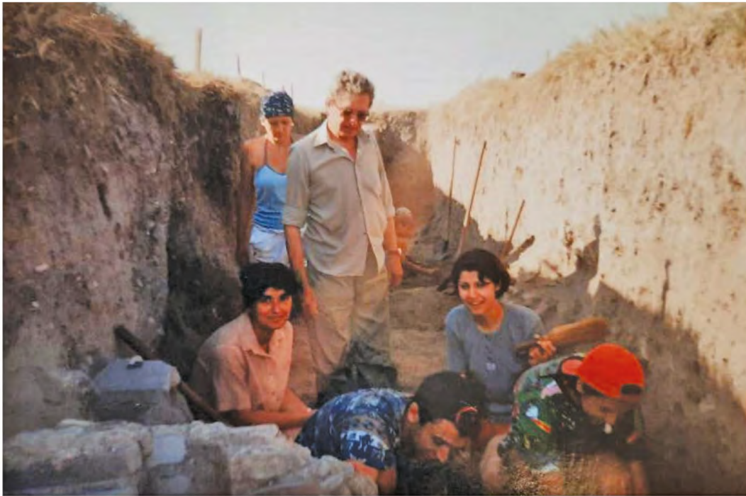
Celei-Sucidava. During the practical training of the 2008 series of undergraduates