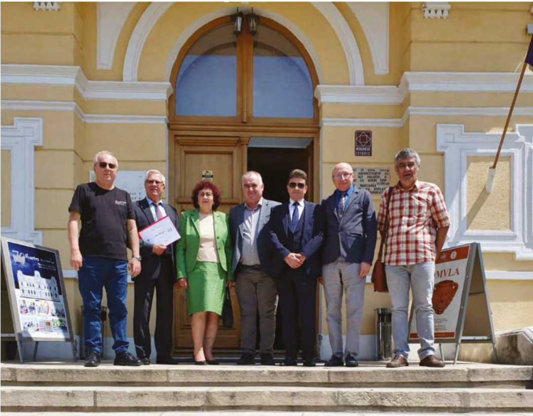
The Olt County Museum, Slatina. Launch of volume II of the Romula series (May 2022)